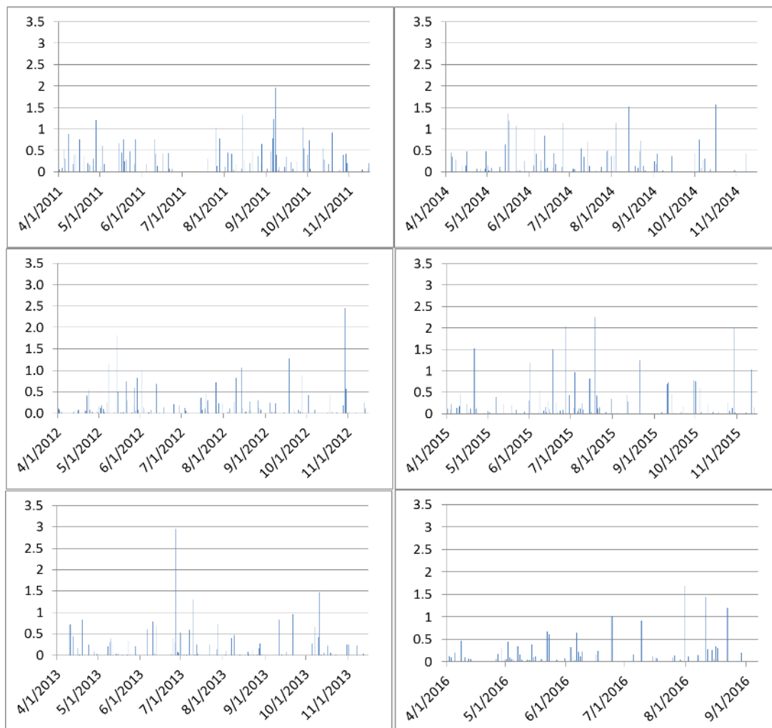
Figure 1. PSU NESARE dairy cropping systems daily growing season precipitation (in) (2011-16).