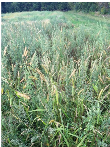
Figure 1. Flax control plot.

The Schmotzer hoe was very effective at removing weeds from the flax plots. From weed counts taken before and after cultivation on 4-Jun, the average percent of weeds removed from tine weeding was 23.4% while the average percent of weeds removed from wide rows after Schmotzer hoeing was 80.5% (data not shown).