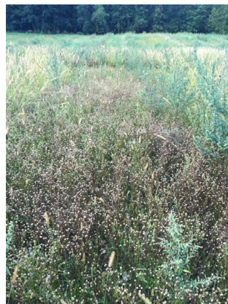
Figure 3. Narrow row flax.