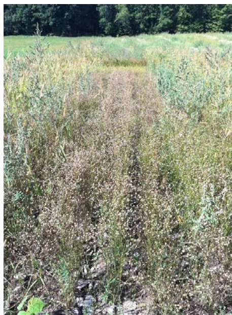
Figure 2. Wide row flax with Schmotzer hoe.