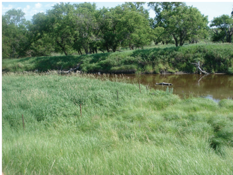
Figure 1. Fence line contrast between an ungrazed (left) and grazed (right) riparian ecosystem.

The removal of vegetation by grazing animals not only influences bank stability, but also can decrease the amount of runoff compared with heavily grazed riparian ecosystems. See Figure 1 for an example of a grazed and ungrazed riparian ecosystem.