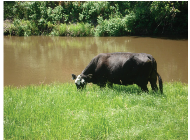
Figure 2. Example of a riparian ecosystem grazed at a moderate stocking rate.

Strongly rooted native plant species such as beaked sedge ( Carex rostrata Stokes), water sedge ( Carex aquatilis Wahlenb.), bluejoint reedgrass ( Calamagrostis canadensis (Michx.) P. Beauv.) and baltic rush ( Juncus balticus Willd.) have been reported to increase in ungrazed and lightly grazed pastures (Clary 1999) (Figure 3). Clary (1999) showed a downward trend in Kentucky bluegrass ( Poa pratensis L.) when these strongly rooted native graminoids increased.