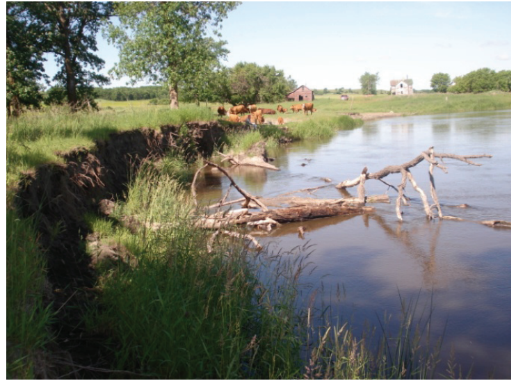
Figure 4. Photos depicting heavily grazed riparian ecosystems, which lead to bank instability.

instead of deep-rooted native species, are less stable and more vulnerable to erosion and mass wasting.