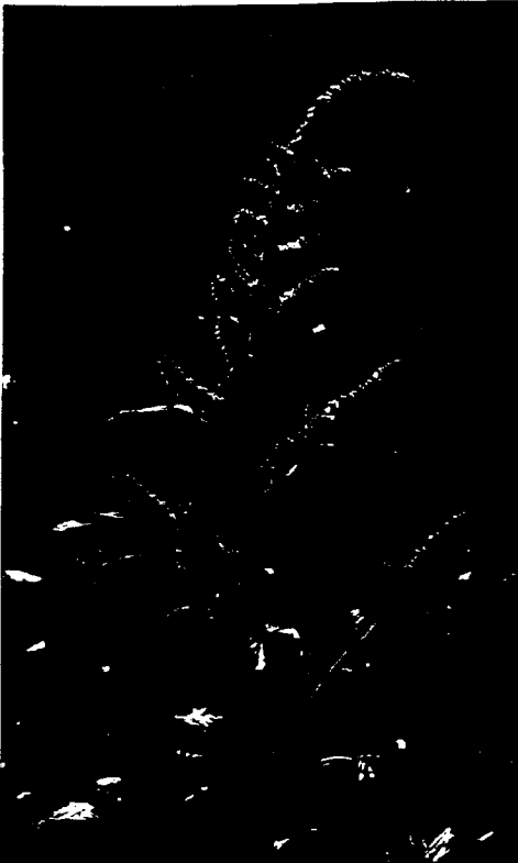
Higher populations of pigweed, a preferred host of the armyworm, seemed to aggravate pest problems for the organic tomatoes.

tor setup used varied according to the crop. In processing tomatoes, cultivation was done using a pair of disks, each set within 2 inches of the tomato seedline followed by L-shaped weed knives to clean the sides of the beds. Safflower and beans were cultivated using a rolling cultivator (Lilliston),