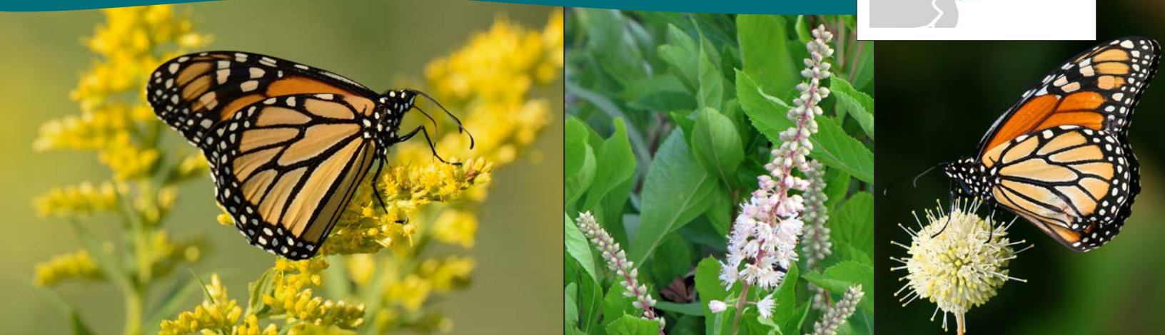
Left to right: Monarch on showy goldenrod, coastal sweet-pepperbush, and monarch on buttonbush.

The Northeast region, composed of the New England states of Maine, New Hampshire, Vermont, Massachusetts, Rhode Island, and Connecticut, as well as eastern New York, is characterized by shifting coastal dunes, deciduous forests, and riparian corridors. Rich floral diversity within these habitats supports thousands of species of bees, butterflies, and other pollinators, including northern populations of summer breeding and fall migrating monarchs. Depending on the year, monarchs can be found throughout the region, often favoring open fields and meadows, river valleys, and coastlines.