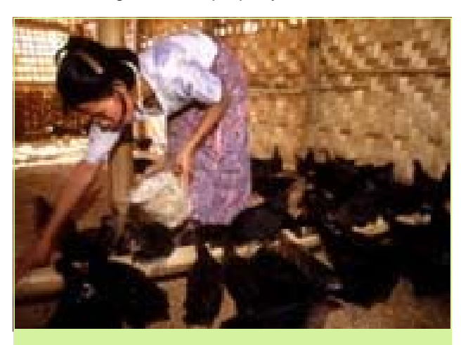
Woman Feeding Chickens

March 15 was International Women's Day. FAO held a major event on gender and property rights. The issue of women's legal access to property is particularly problematic in certain regions of the world. A major concern in southern Africa is property grabbing of land and other agricultural property from widows whose