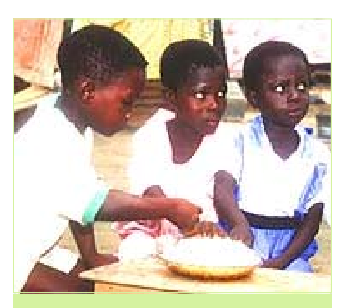
Children Eating

From January to April this year, my work has taken me to the United Nations Food and Agriculture Organization (FAO) in Rome. FAO, an organization of 189 member countries, pursues the goal of achieving food security for everyone in the world. The most recent FAO report on hunger reports that 842 million people suffer from chronic