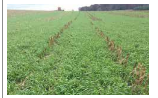
Cover crops contributed 9,281 lbs to phosphorus reduction in 2017.

The report breaks down phosphorus delivery reduction achieved, along with the number of acres and the cost per pound of phosphorus for each practice. It is important to note that conservation techniques endorsed by YPF have been adopted as best-management practices for farmers in the program. For each practice, the number of acres without cost-share far exceeds the number of acres with cost-share.