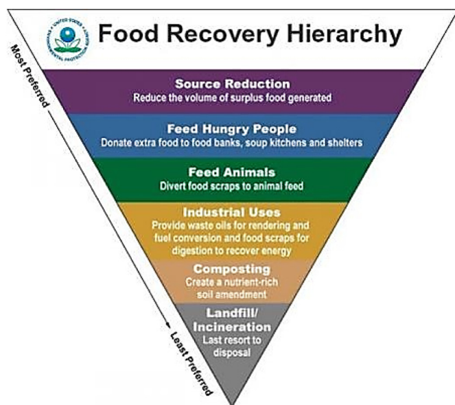
Fig. 1. EPA food recovery hierarchy (EPA, 2015).