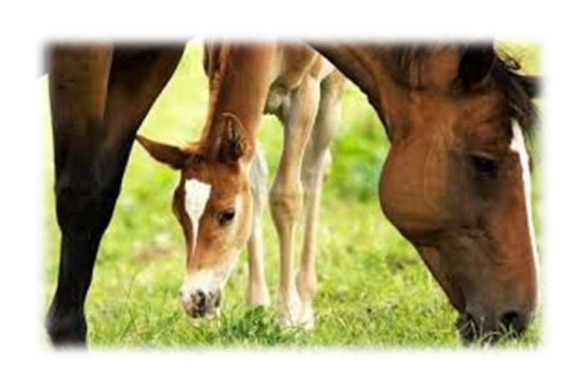
Module 2. Equine Parasite Resistance – How Does it Happen? Can it Happen to You?