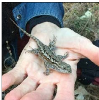
Western fence, or blue-belly, lizard found in a coniferous forest near Applegate, Oregon.

The American marten, or pine marten, is found in Oregon's high forests.