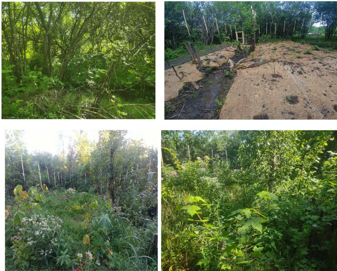
Figure 1. Progression of restoration in RV. RV plot before buckthorn and associated invasives removal (top left); same plot soon after planting in May 2020 (top right) showing landscape fabric and a few mycorrhizal species that persisted after the restoration process. Same restored plot in September 2020 (bottom left) and August 2021 (bottom right).

colonial agriculture crops. This research assumed that mycorrhizal colonization of soils would be, by design, different among the treatments. We measured hyphal density using the line-intersect method (Tennant 1975). Though both AMF and ECM grow in this landscape, we focus only on AMF with which the majority of the palette associate (Table 1).