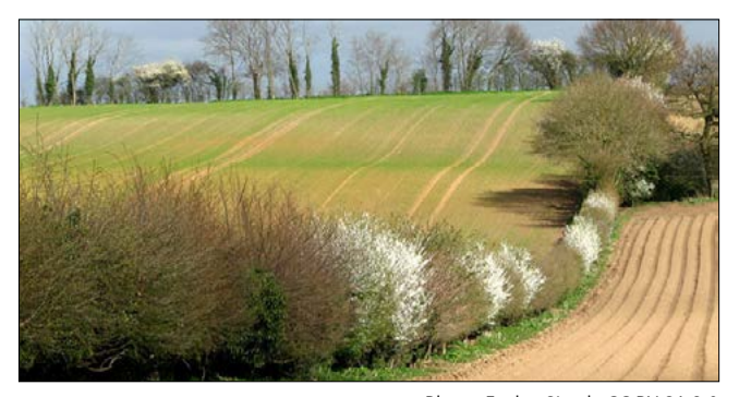
Hedgerows provide diverse habitat where two or more plant communities meet.

Avoid invasive plants when choosing plants from nurseries. Verify with your nursery that plants you purchase are not invasive. Purple loosestrife ( Lythrum salicaria ), Japanese knotweed ( Fallopia japonica ), heavenly bamboo ( Nandina domestica ) and Scotch broom ( Cytisus scoparius ) are examples of ornamentals that have become serious management problems. Such aggressive aliens can decrease available habitat for native species and contribute to their decline. Consult your local native plant society or state agricultural office for lists of noxious species.