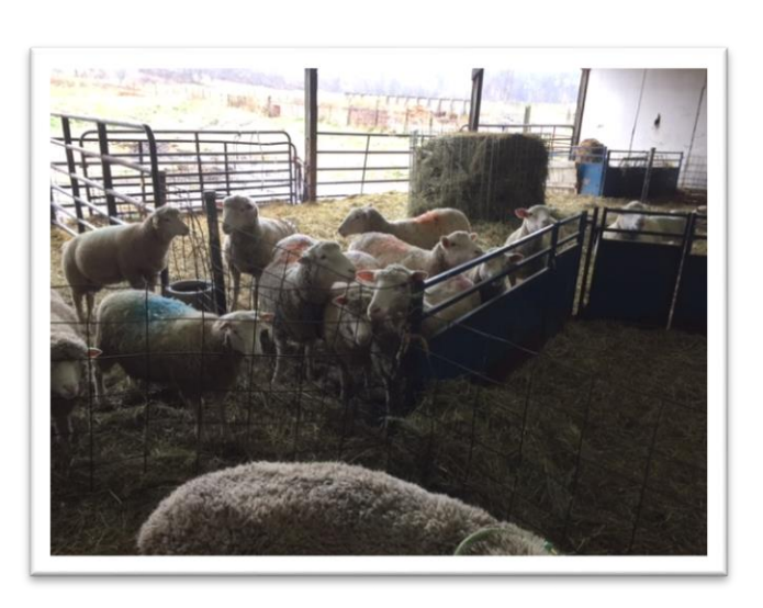
Ewes in induced heat interested in ram

Tip: be sure to take time of day into account. If you remove the CIDR at 3:00PM you will have to inseminate at 9:00pm two days later so choose a time earlier in the morning to remove the CIDR and inject with PG600.