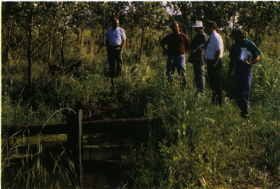
▲ The third component of the bufferstrip system involves creation of small wetlands and use of their natural purification process.

grass, shrubs and trees was four to five times greater than in the corn/soybean field immediately adjacent. In other words, water soaks into the soil of the bufferstrip at rates of four to five inches per hour while only soaking in at one to one and one half inches per hour in a cultivated field.