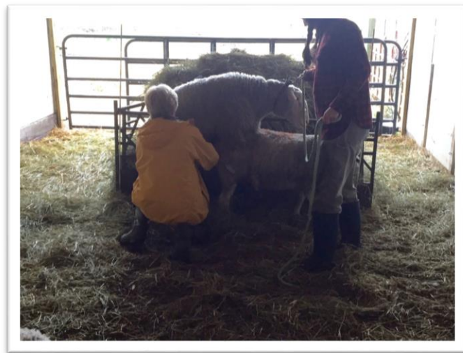
Collecting Ram with AV