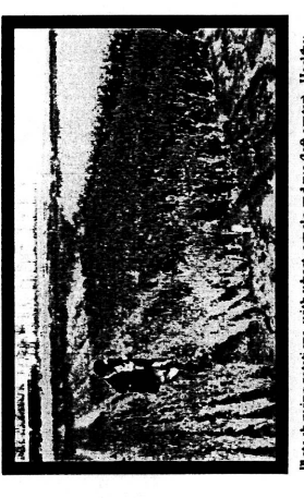
Plots showing totations with wheat, canola and tye (left center). Head thy wheat at right. Wheat shunled and poorly till cred because of take-all (left).

Beginning in the 1970s wheat solvean double cropping became a favored row crop farming system in the Southeast. As wheat production increased, take-all root rot, caused by Gaesmannomyces argaintive warner as acrinous problem where where it was not constant to the source or more consecutive years. Coop rotation is the main method to manage take-all. Research showed that failbow or const in place of wheat were the only alternatives to wheat. Barley and rye are conjunidly affected by the disease, but they maintain the fungue sta level that results in serious take-all damage when wheat is planed the next seems. Solveens maintain the fungue at a high level also. Sorghum as a summer coop reduced take-all in the following wheat crop. A project was started in 1974 to investigate is planed to next seems. Solveens maintain the fungue at a high level also. Sorghum as a summer coop reduced take-all in the following wheat crop. A project was started in 1974 to investigate welre long-term rotation sequences were stablished in replicated plots at the Southwest Branch Station at Plains. A winter tye cover crop killed in early March or canola were alternatives to wheat. Pearl inflet for grain was grown in some rotations as an alternative to solveens.