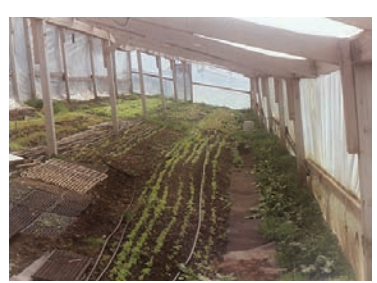
Organic salad greens being grown on a slope within a shade house. Nashville, IN.