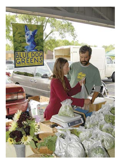
Besides supplying numerous local restaurants with fresh produce, Blue Dog Greens Organic Farm also participates in a profitable Saturday morning farm market in southwest Michigan.