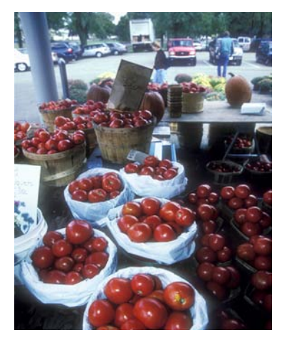
Organic farm produce ready for market. Kalamazoo, MI.