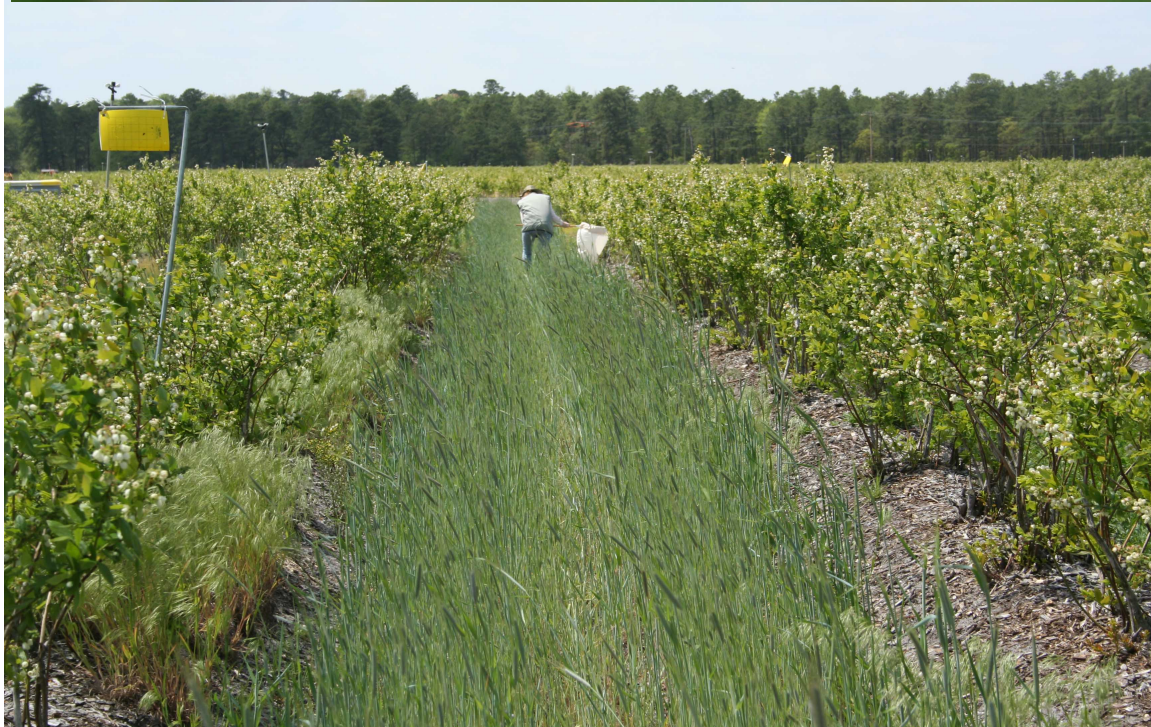
Sweep-net sampling in progress in a winter rye cover cropped plot. A yellow sticky trap is seen in the foreground.