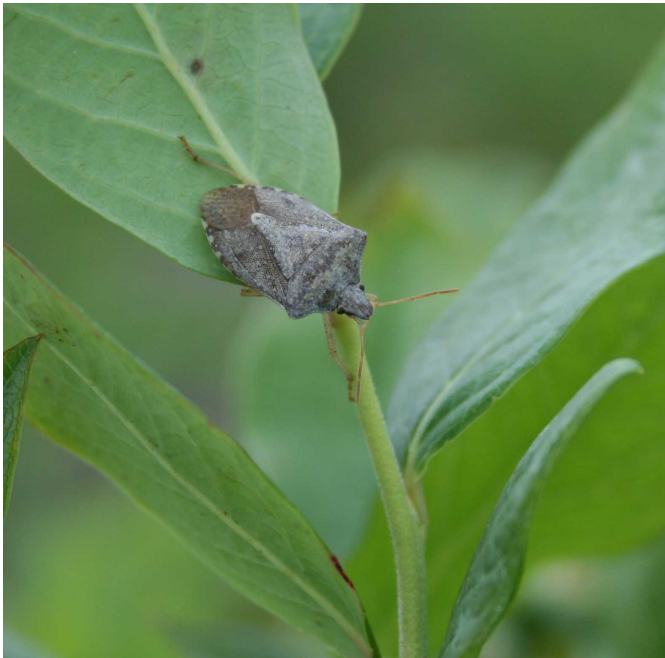
Podisus spp. , a generalist predator