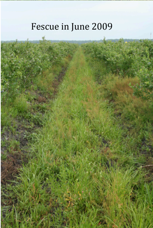
Fescue in June 2009