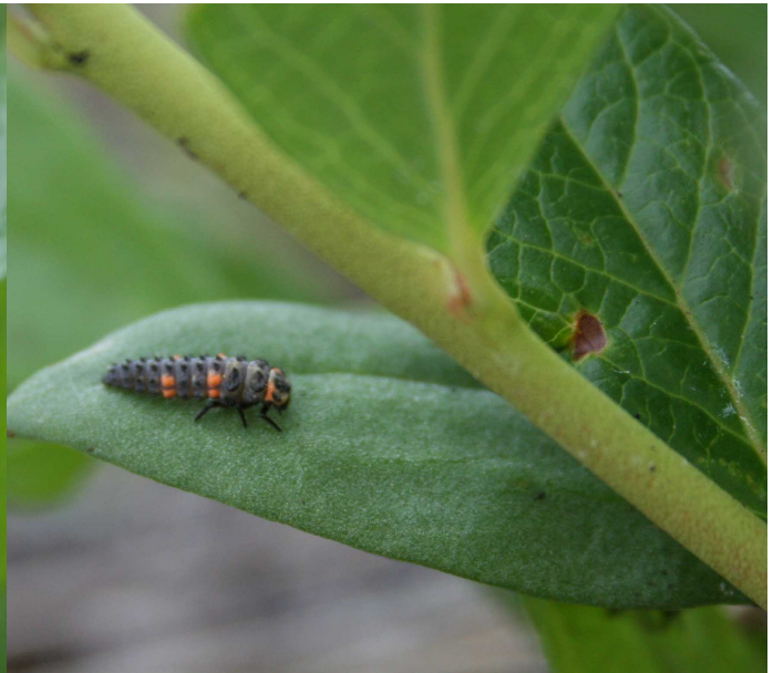
A ladybeetle larva