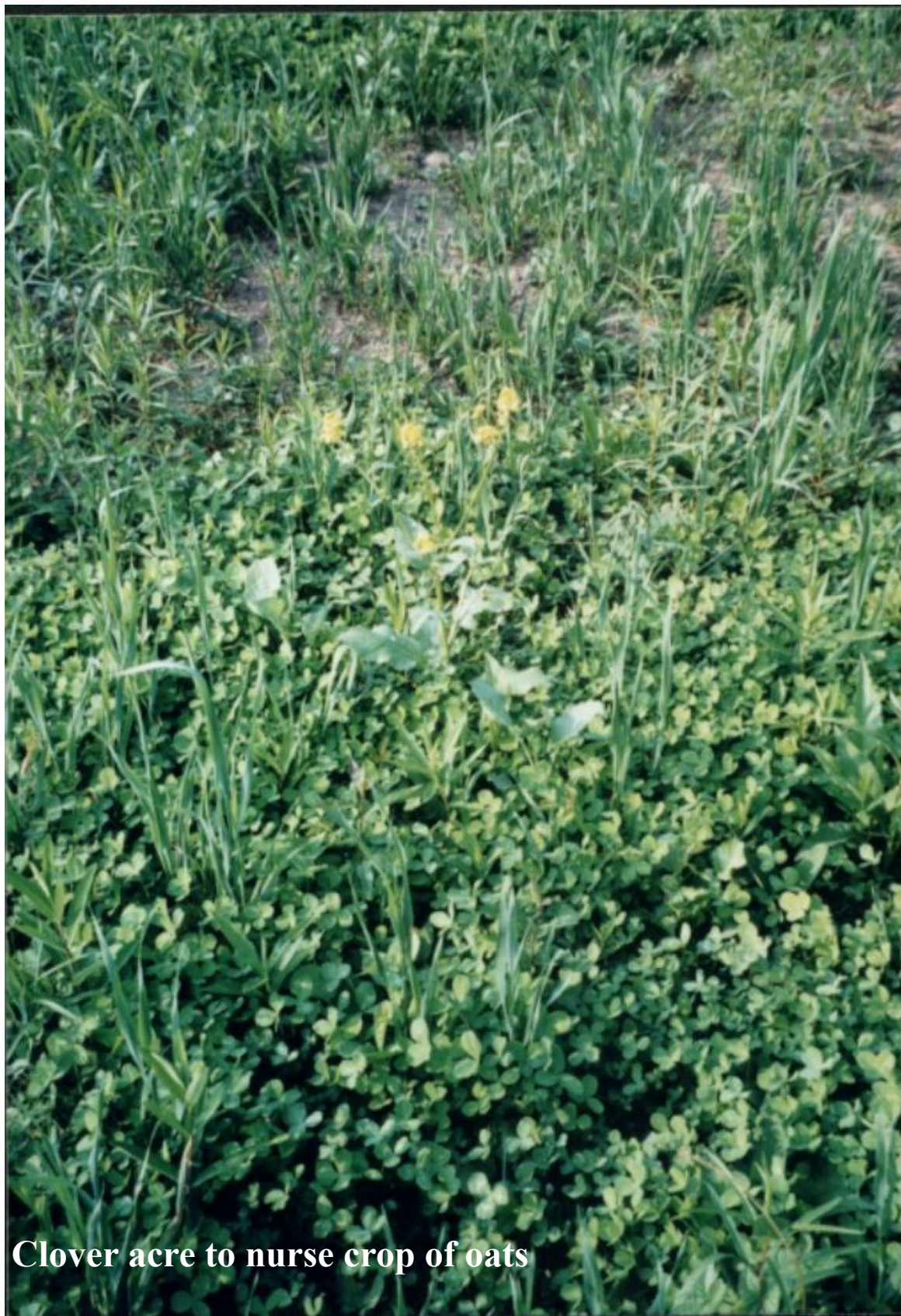
Clover acre to nurse crop of oats