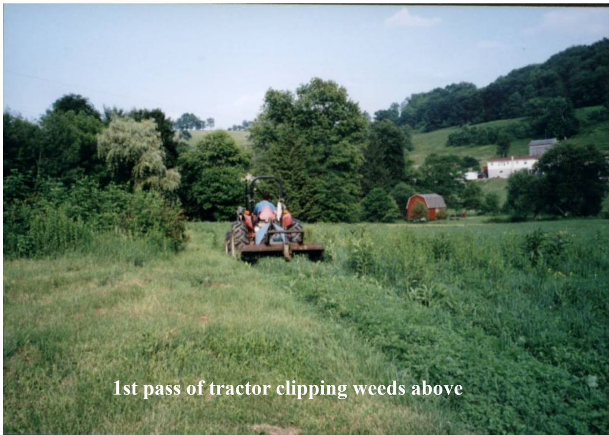
1st pass of tractor clipping weeds above