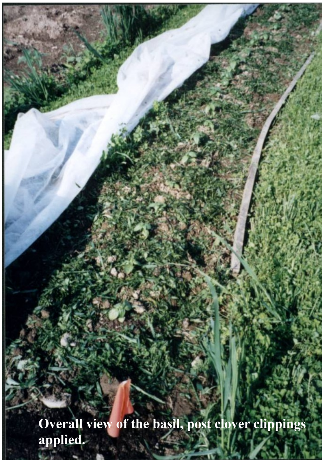
Overall view of the basil, post clover clippings applied.