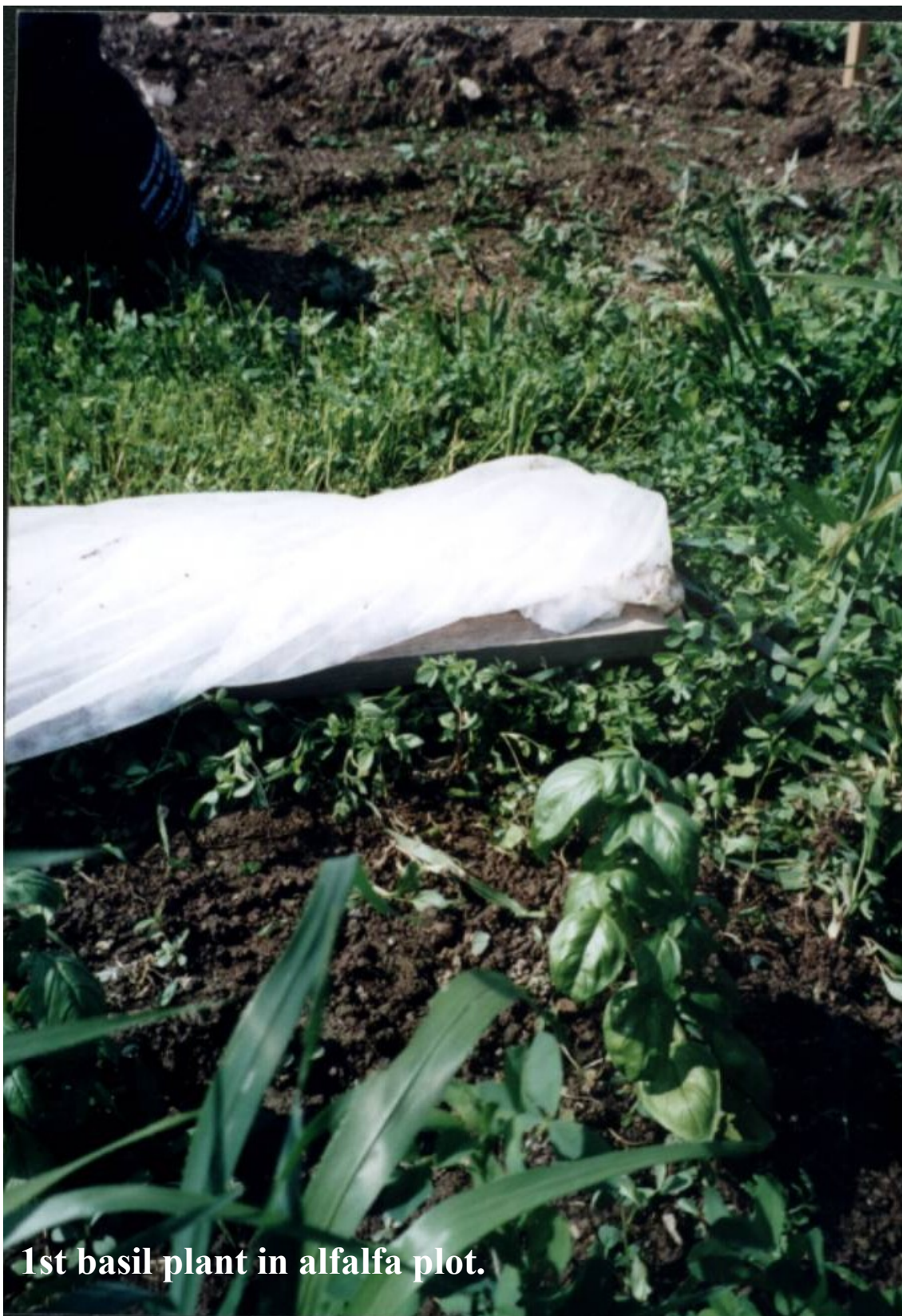
1st basil plant in alfalfa plot.