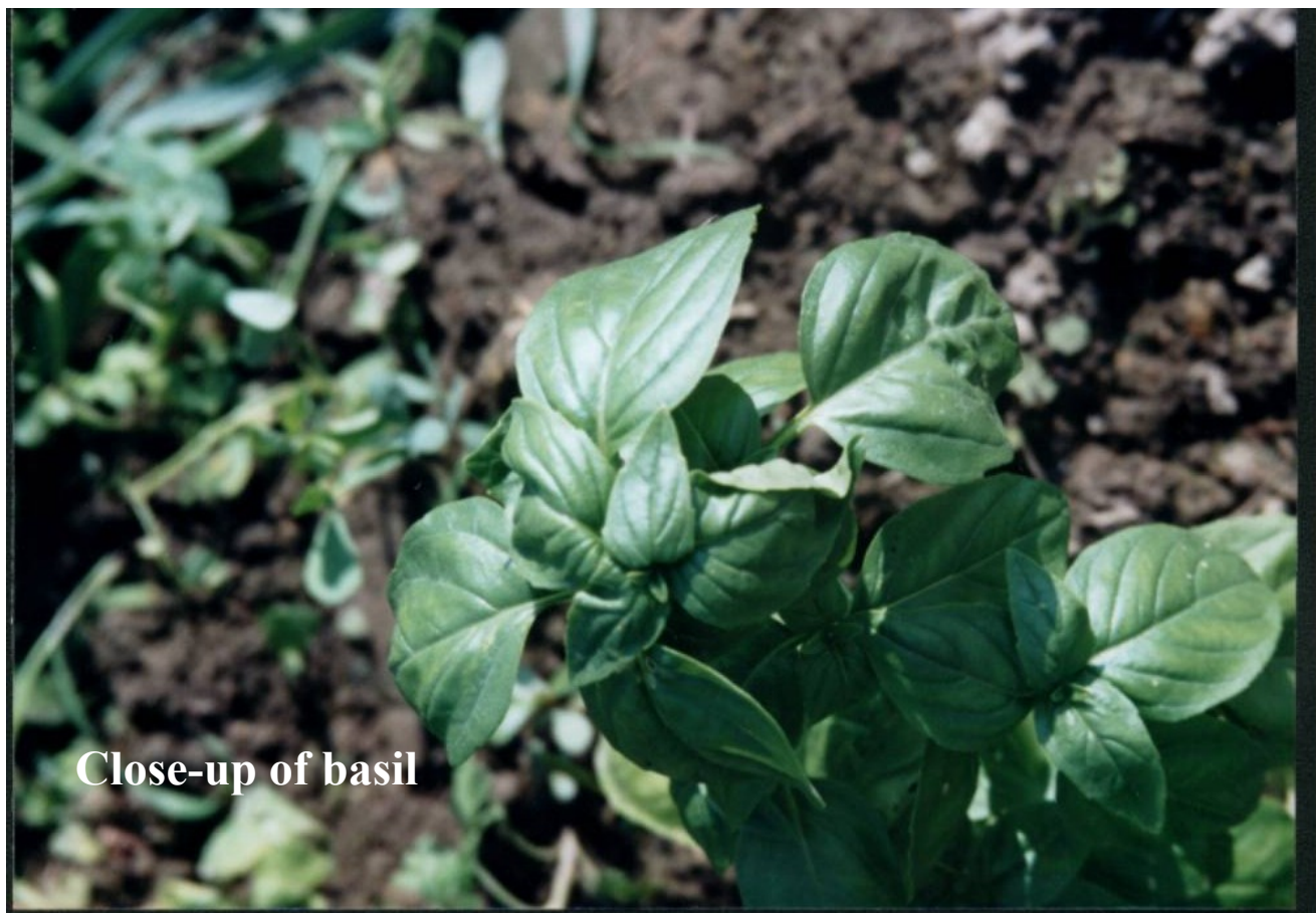
Close-up of basil