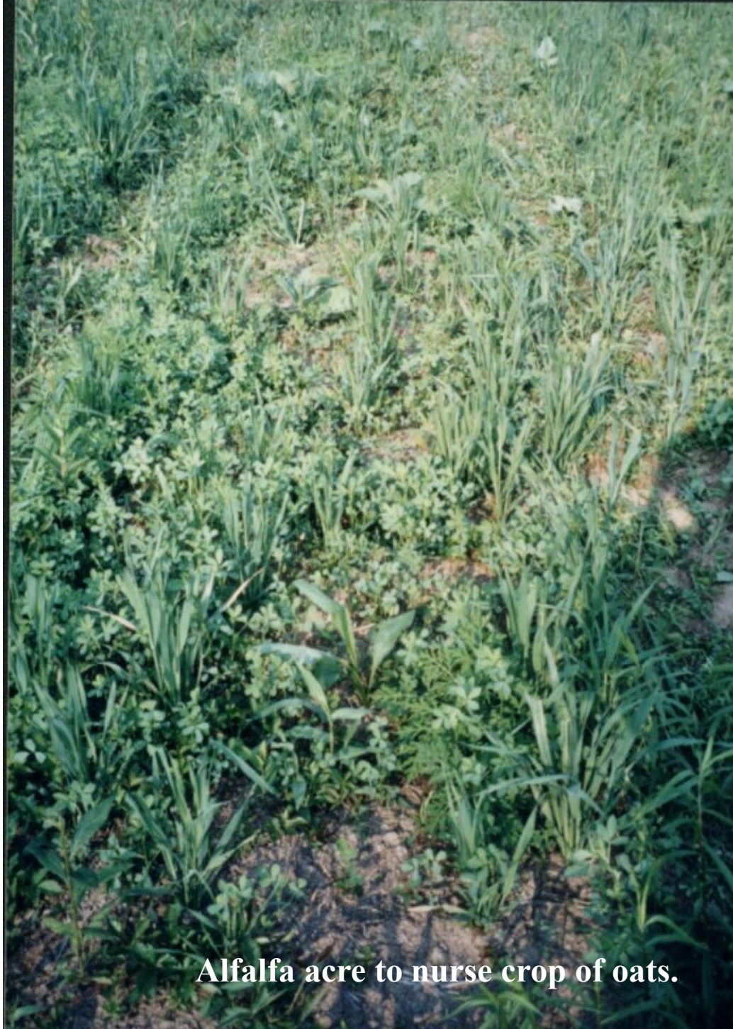
Alfalfa acre to nurse crop of oats.