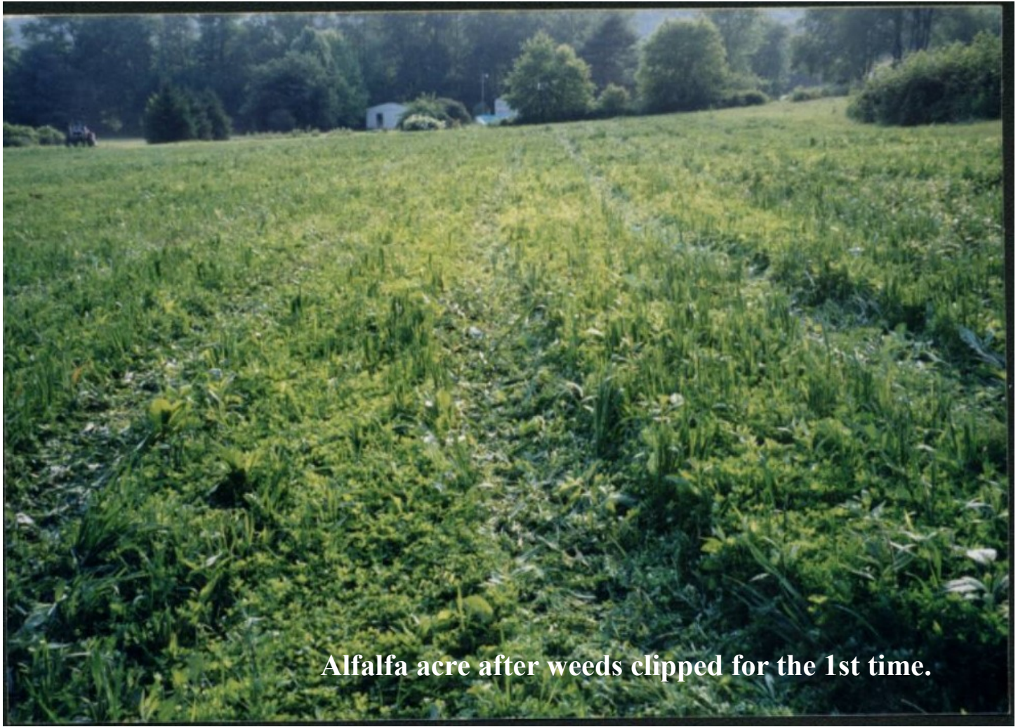
Alfalfa acre after weeds clipped for the 1st time.