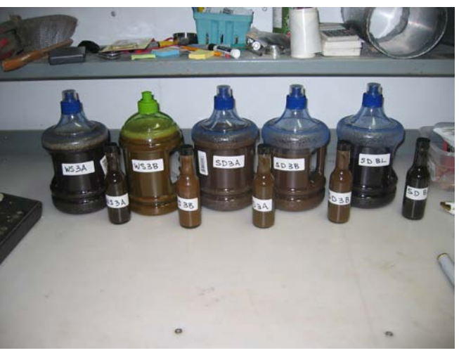
Figure 90 – Post-hydrolysis extract samples