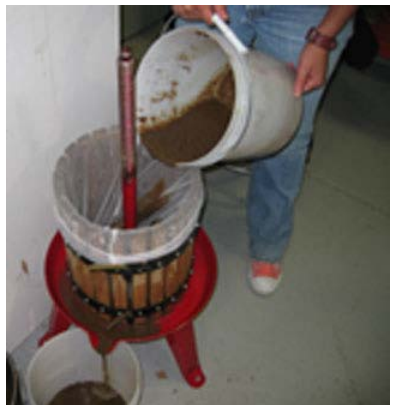
Figure 17 – Putting post-hydrolysis sample in filter press