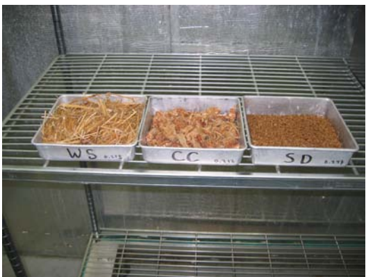
Figure 1 - Wheat straw, corn cob, and saw dust samples prepared for drying and moisture determination.

This work examined the result of mushroom growth on three types of substrate: sawdust, wheat straw, and corncobs. Shiitake mushrooms (Lentinula edodes) were grown on the sawdust substrate and oyster mushrooms (sajor caju) were grown on the wheat straw and corncob substrates. FMC prepared mushroom substrate formulations as planned and collected spent substrate samples at four stages: precolonization; post-colonization and pre-fruiting; postfruiting; and post hydrolysis.