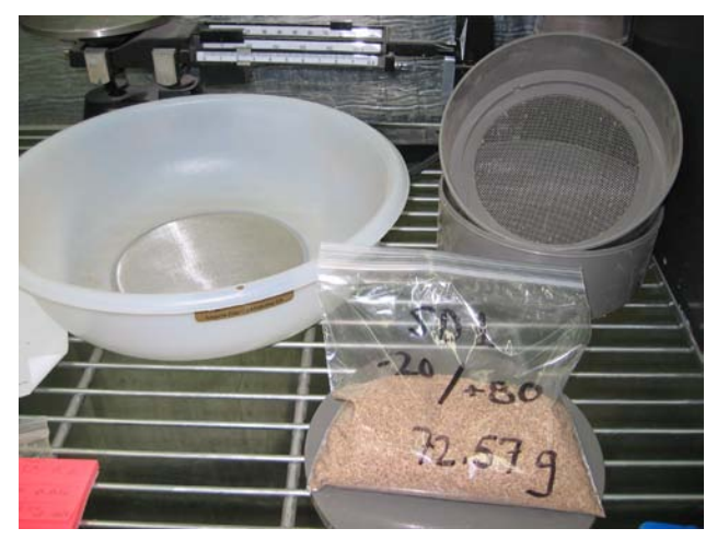
Figure 6 - Fine screen.