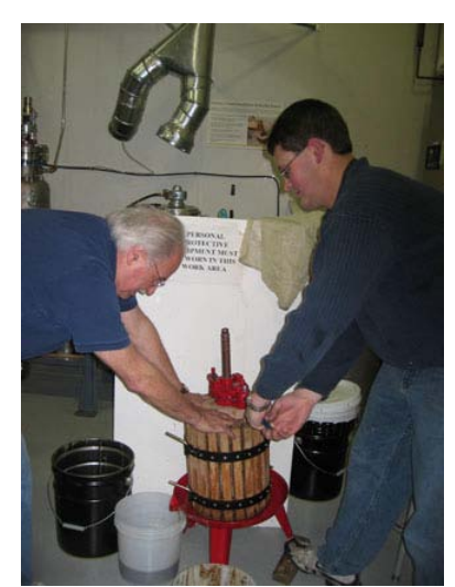
Figure 18 – Extract removal