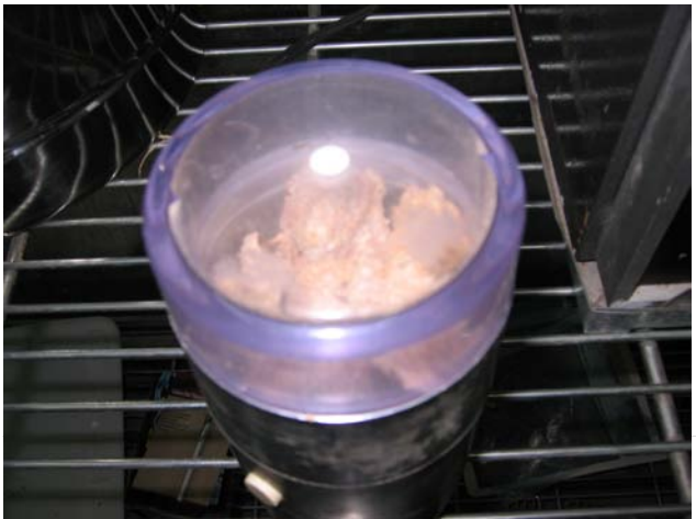
Figure 3-- Grinding sample.