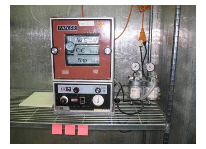
Figure 2 - Drying samples.

Collected substrates were sampled and prepared for analysis following NREL Laboratory Analytical Procedure (LAP) 2004, Preparation of Samples for Compositional Analysis <u>http://devafdc.nrel.gov/pdfs/9362.pdf</u>).