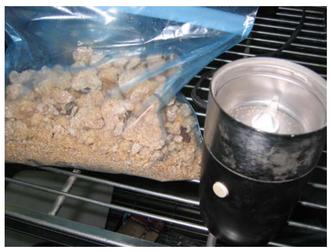
Figure 3 – Dried Sample.