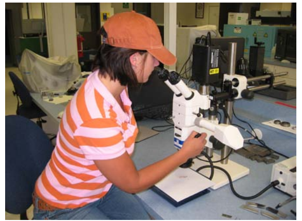
Figure 8 - Microscopic assessment of lignin deterioration

over a 24 hour period. The samples were then screened, dried and weighed again to determine the percentage of the solids hydrolyzed.