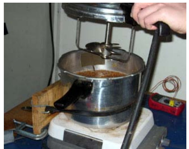
Figure 15 – Hydrolysis set up