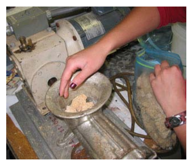
Figure 14 – Grinding sample for hydrolysis