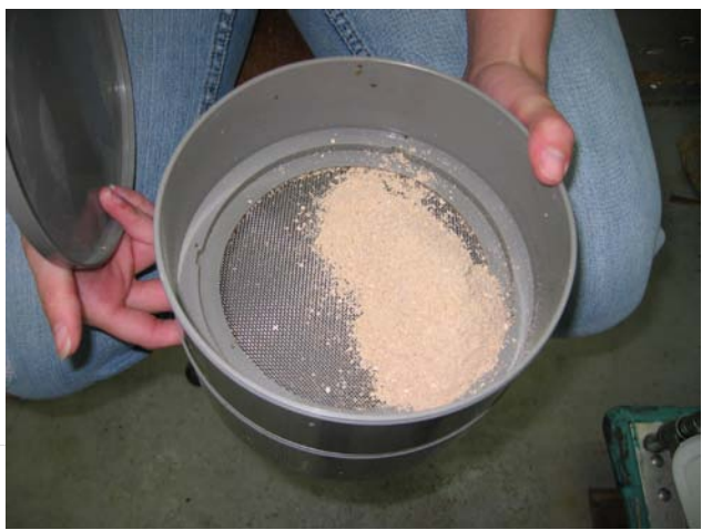
Figure 5 - Coarse screen.