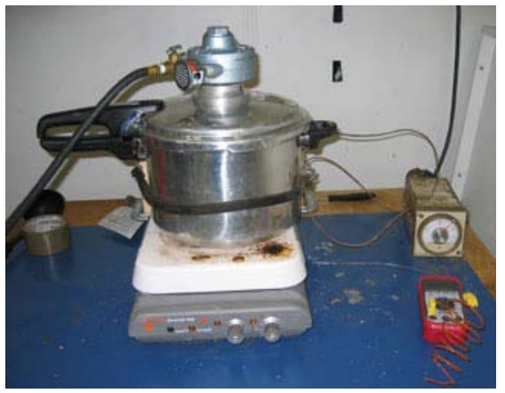
Figure 16 – Hydrolysis set up