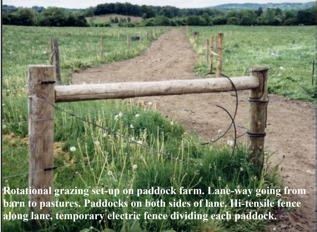
Rotational grazing set-up on paddock farm. Lane-way going from barn to pastures. Paddocks on both sides of lane. Hi-tensile fence along lane, temporary electric fence dividing each paddock.