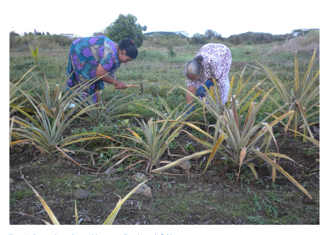
Figure 4: Community garden participants weeding pineapple field