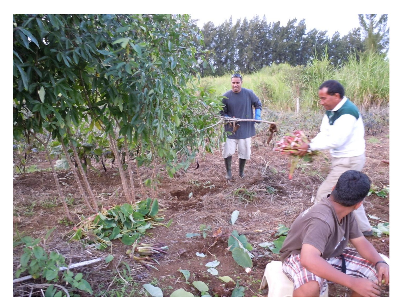
Figure 1 Community Garden Participants Harvesting Cassava and Taro

Sustainable Agriculture This project was partially funded by Western Sustainable Agriculture Research and Education.