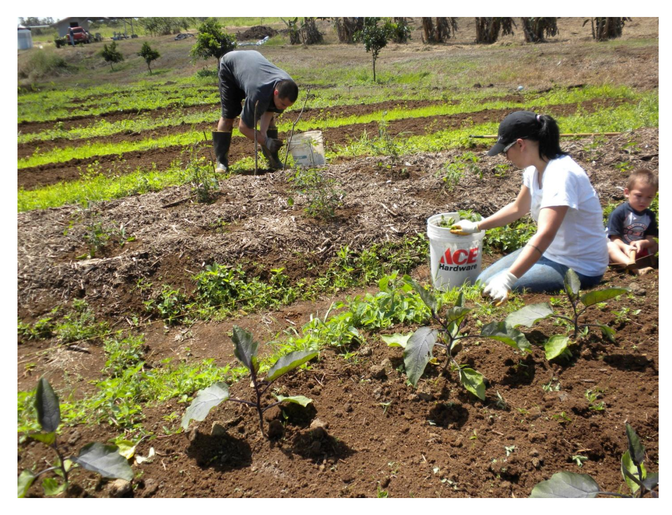
Figure 2 Families weeding and Planting