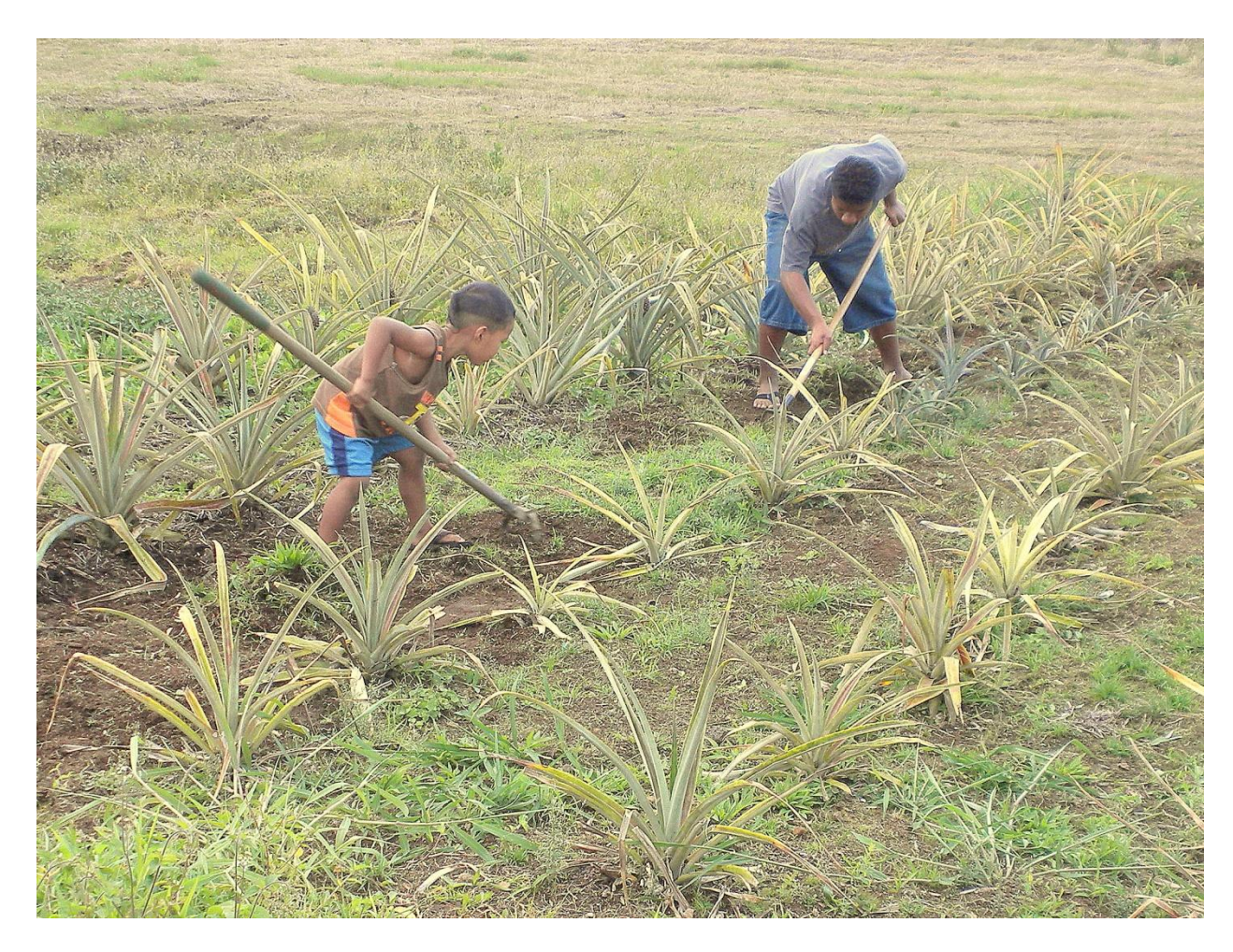
Figure 5 Community Garden youth participants weeding pineapple field