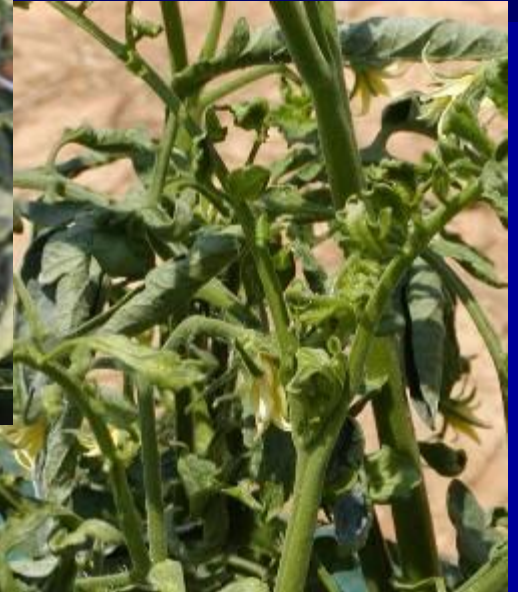
Carry over damage