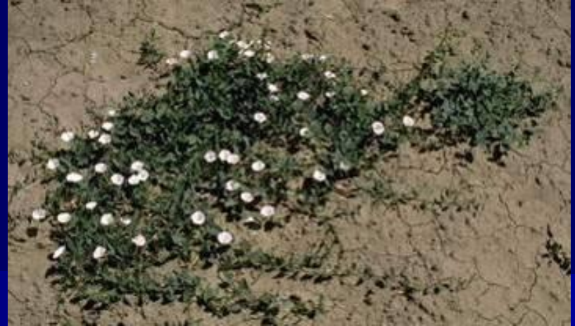
Field bindweed aka:wild morninglory