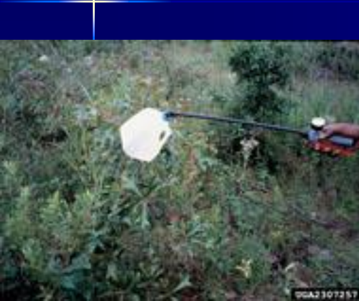
Plastic bottle shield