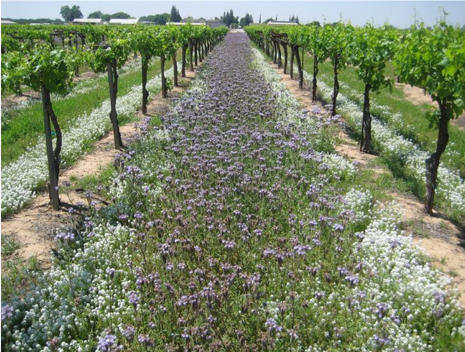
Photo 2. Fagopyrum esculentum and Lobularia maritima