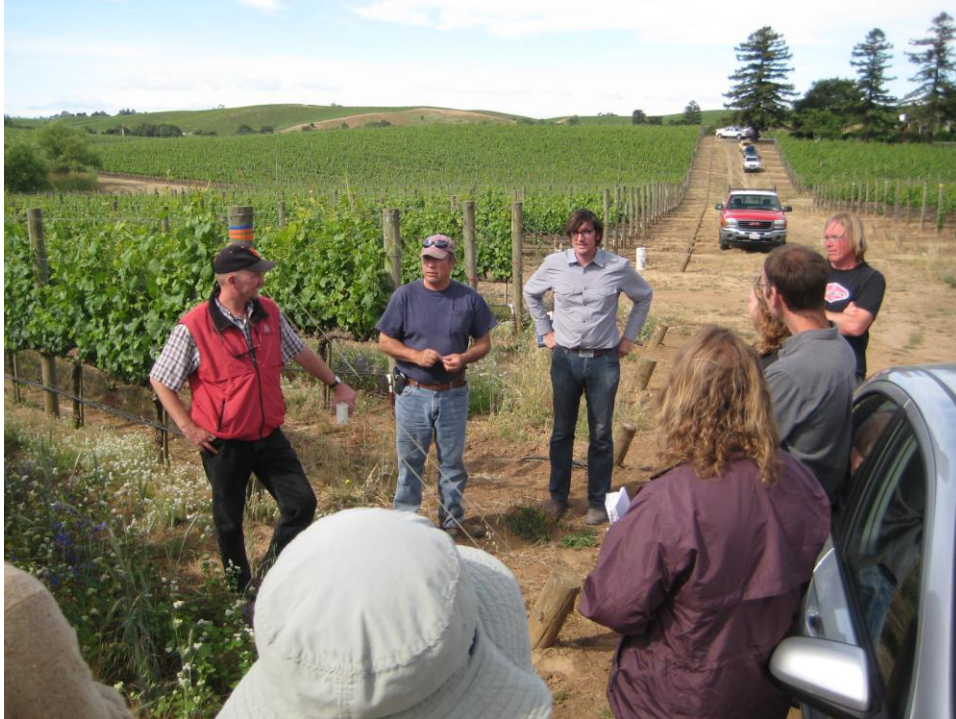
Photo 6. Farm-worker Training Session