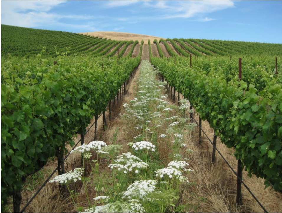
Photo 4. Daucus carota