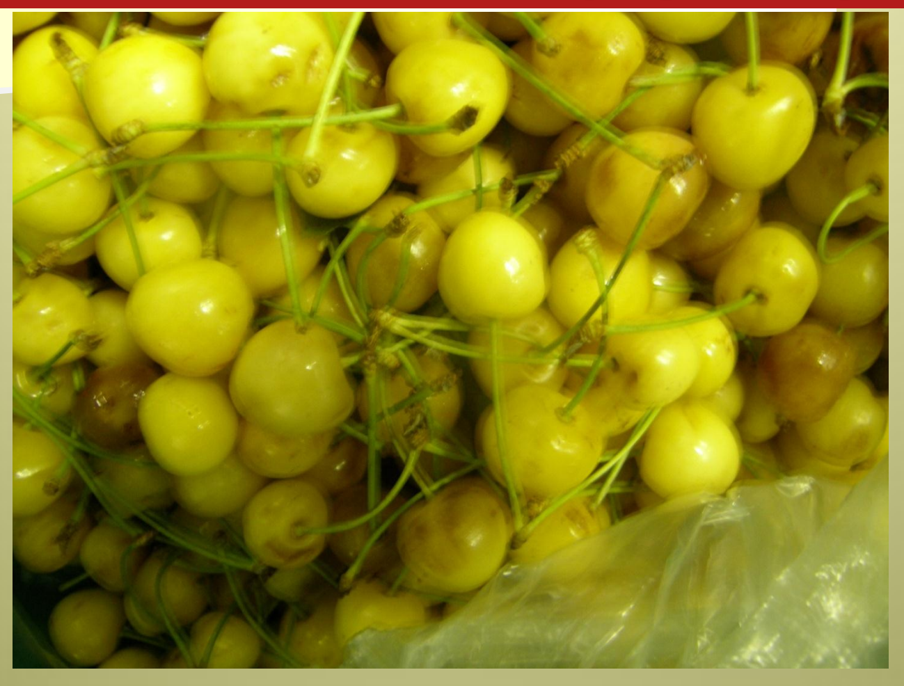
5 weeks MAP