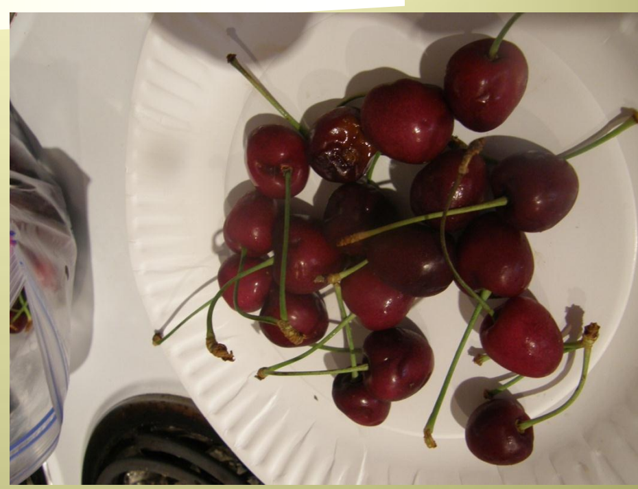
6 weeks MAP