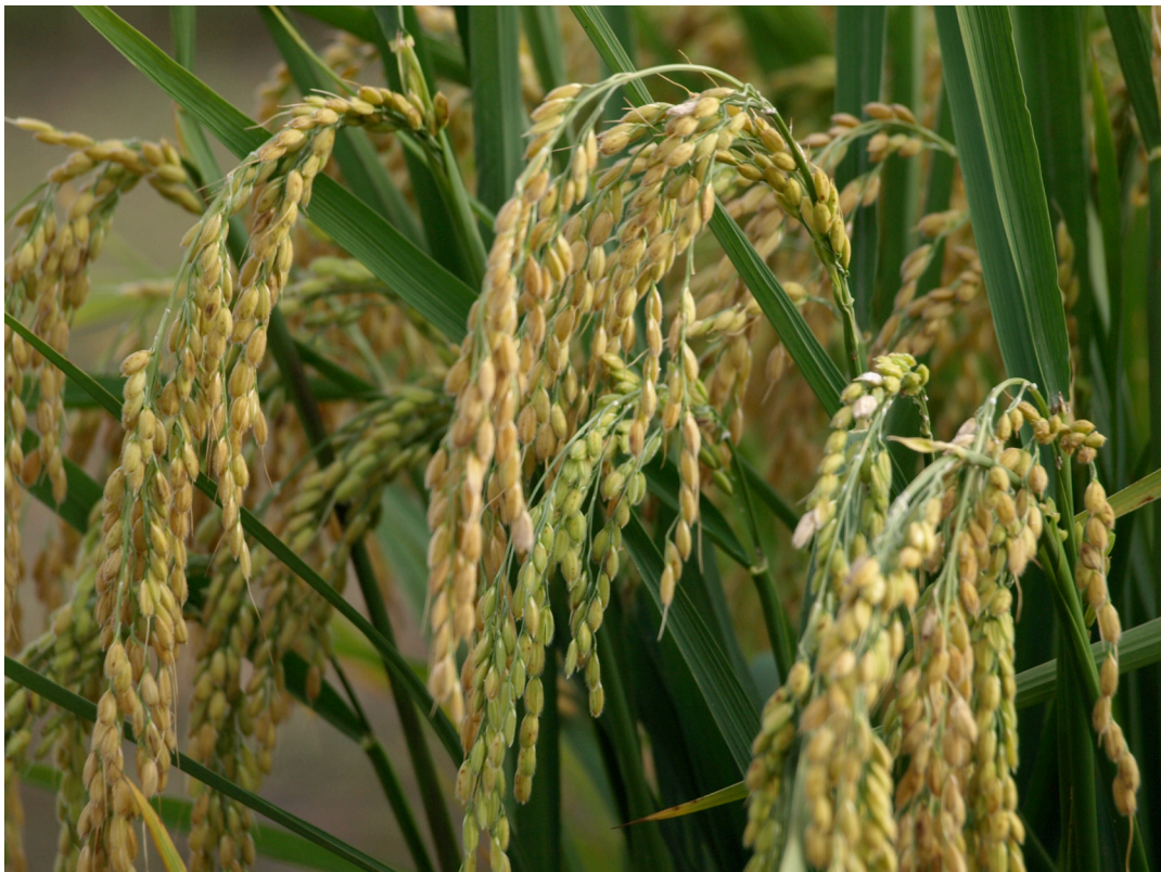
Photo 6. Close up of mature rice plants, September 23, 2008 (Takeshi Akaogi).