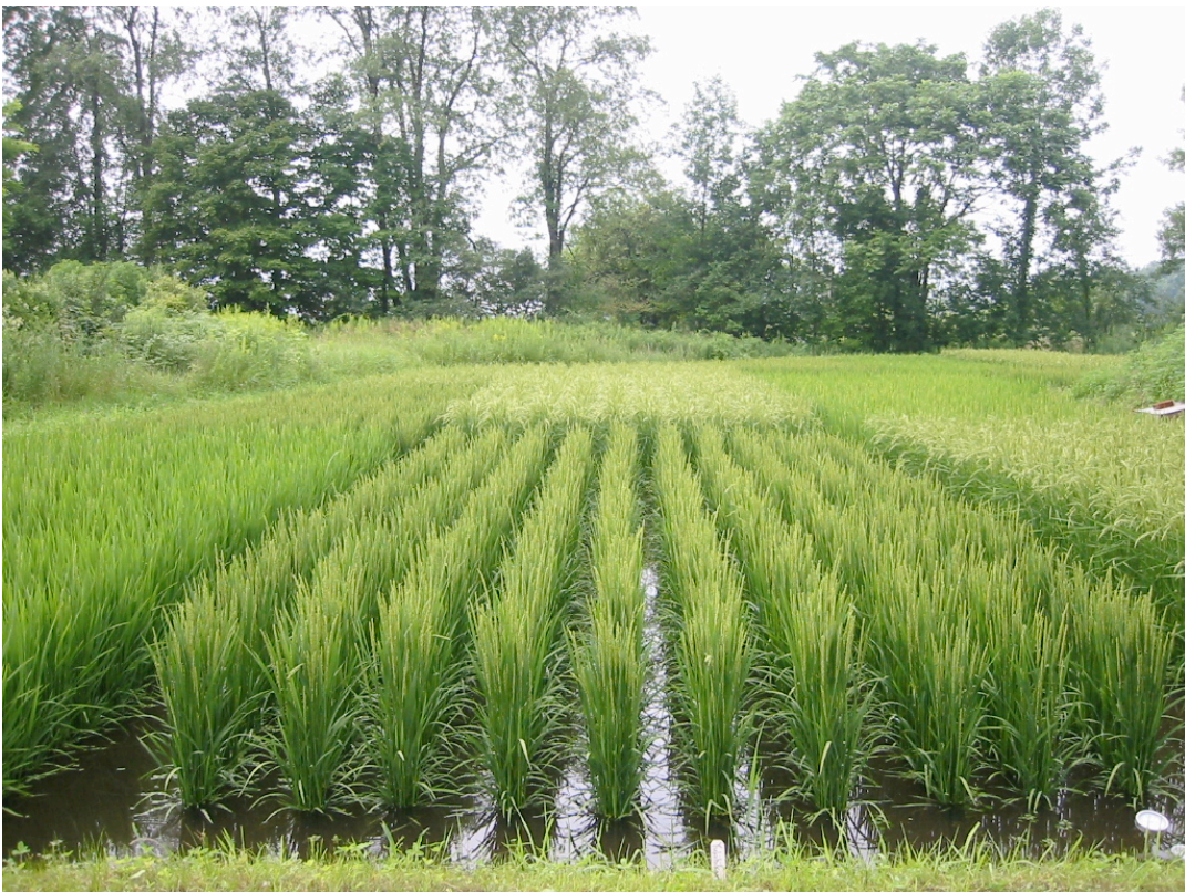
Photo 4. Rice plants during panicle development, July 27, 2008 (Takeshi Akaogi)