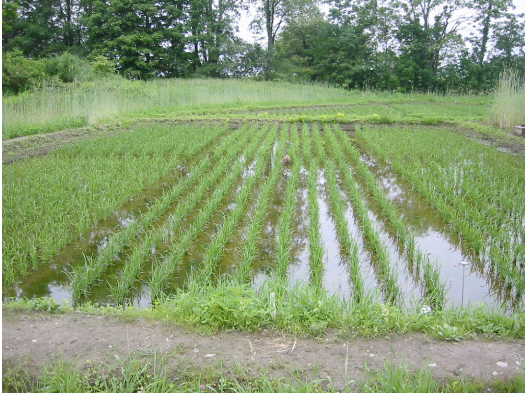
Photo 3. Rice plants about a month after transplanting, June 15, 2008.