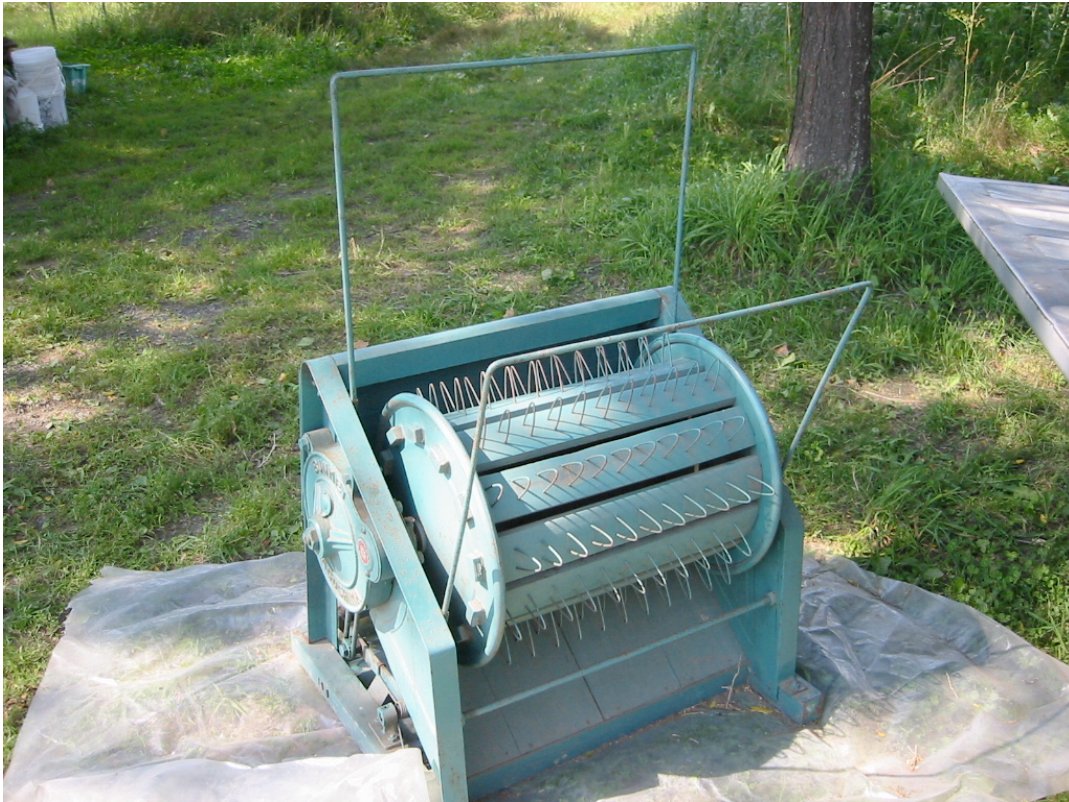
Photo 7. Foot pedal thrasher used to remove the stem from the grain.

Within the rice paddy, water is needed not because the rice needs water to grow but because the water provides heat. Having two inches of water, especially during the first two weeks of May, makes a big difference. If your irrigation water is 50 degrees to start, then heating it up to 60 degrees will provide a much milder condition for the rice and you can avoid the late frost. You can also avoid the cold 50-degree nights by adding water up to \frac{1}{2} to \frac{3}{4} the height of the plant. This is why it is so important to have a paddy that is able to hold water. Having these three things is especially important for growing rice in this marginal climate but if you go down along the Great Lakes or Hudson Valley this is a little bit less of a concern.