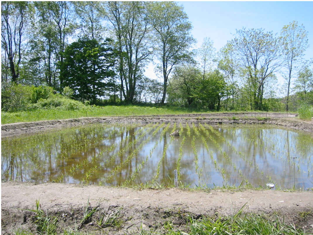
Photo 2. Recently transplanted rice seedlings, May 25, 2008.