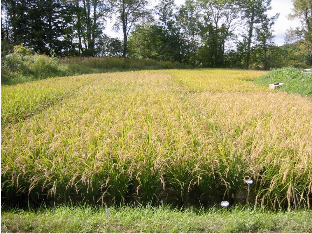
Photo 5. Rice plants after heading and right before harvesting, September 16, 2008.