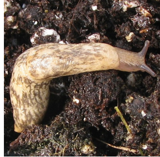
Fig 2. A gray garden slug ( Deroceras reticulatum ) with characteristic markings (though pattern can vary)