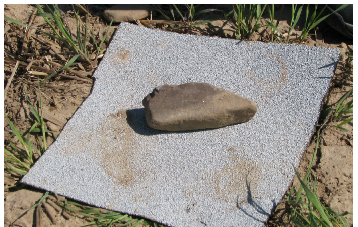
Figure 9: A piece of roofing material used as an artificial slug shelter.