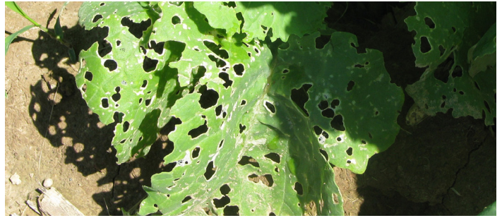
Figure 8: Slug damage to canola.

Slugs eat a wide array of broadleaf plants and grasses, including most crops and many weeds. They harm crops both by killing seedlings outright, causing poor stands, and by damaging leaves on young plants. They feed by scraping the surface of their food, which can include seeds, roots, stems, and leaves. The appearance of their damage varies by crop. In wheat, slugs feed on recently-planted seeds, hollowing them out and killing them. In corn and many small grains, slugs scrape strips in the leaves, leading first to window-pane damage, and then to leaf shredding (Fig. 7). In soybeans, slugs create craters in the cotyledons (Fig. 1), and then ragged holes in the leaves. Similar ragged holes are seen on slug-damaged canola, alfalfa, and other broadleaf crops (Fig. 8). Slime trails are often seen in close association with their damage. Seedlings are especially at risk when the seed slot