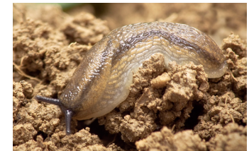
Figure 5: The banded slug ( Arion fasciatus )

Slugs are close relatives of snails - essentially snails without a shell. They are legless, soft-bodied creatures with four front tentacles and a covering of slimy mucus all over the body. They secrete this mucus wherever they go, leaving a characteristic “slime trail” that can be a valuable clue of their presence. Different species vary in color and pattern, but all are various earth tones such as gray, brown, or orange. Again varying by species and age, slugs can range in size from a fraction of an inch to several inches. Juvenile slugs resemble adults but are smaller. Slug eggs are small, gelatinous spheres or ovals found under residue or in the soil (Fig. 6). The eggs are often found in clumps but may also occur singly.