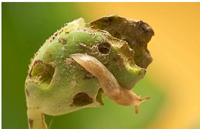
Figure 1: A juvenile gray garden slug ( Deroceras reticulatum ) on soybean.

Of the 20 or so slug species that occur in Pennsylvania, four are common in field crops: the gray garden slug ( Deroceras reticulatum , Fig. 1, 2), the marsh slug ( Deroceras laeve , Fig. 3), the dusky slug ( Arion subfuscus , Fig. 4), and the banded slug ( Arion fasciatus , Fig. 5). While the relative importance of each species is not well understood, the gray garden slug often occurs in the largest numbers and is most often associated with crop damage. This is a medium-sized, light to dark gray slug that produces sticky, white mucus when disturbed. All of these slug species were introduced from Europe with the exception of the marsh slug, which is thought to have mixed native and introduced populations.