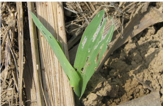
Figure 7: Slug damage to corn.

Unfortunately, management options for slugs are limited. Moreover, recognized tactics are occasionally ineffective; therefore, an integrated management approach that relies on several control tactics is preferred. Most growers who experience slug problems are committed to no-till or reduced-till practices, so