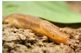
Figure 4: The dusky slug ( Arion subfuscus )