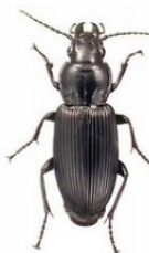
Figure 10: Pterostichus melanarius , a slug-eating beetle.

Pesticides are poisonous. Read and follow directions and safety precautions on labels.