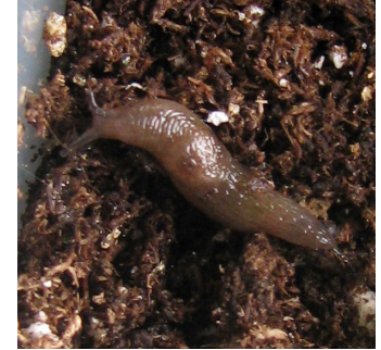
Fig 3. The marsh slug ( Deroceras laeve )