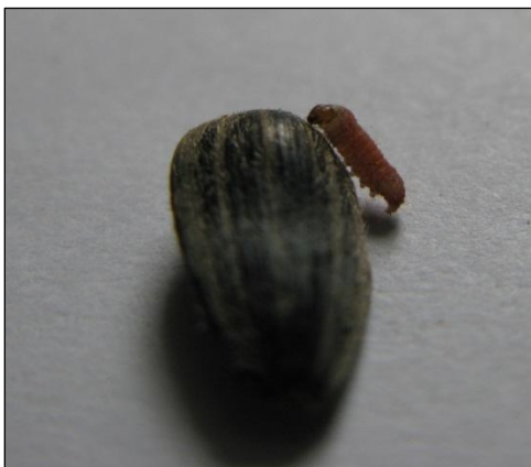
Figure 2. Banded sunflower moth larvae.