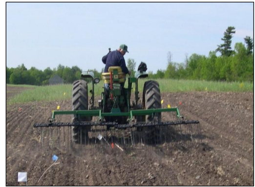
Figure 3. Tinweeding after planting, Alburgh VT

Variations in yield and quality can occur because of variations in genetics, soil, weather, and other growing conditions. Statistical analysis makes it possible to determine whether a difference among treatments is real or whether it might have occurred due to other variations in the field. All data was analyzed using a mixed model analysis where replicates were considered random effects. At the bottom of each table a LSD value is presented for each variable (e.g. yield). Least Significant Differences (LSDs) at the 10% level (0.10) of probability are shown. Where the difference between two treatments within a column is equal to or greater than the LSD value at the bottom of the column, you can be sure in 9 out of 10 chances that there is a real difference between the two values. Treatments listed in bold had the top performance in a particular column; treatments that did not perform significantly lower than the top performer in a particular column are indicated with an asterisk.