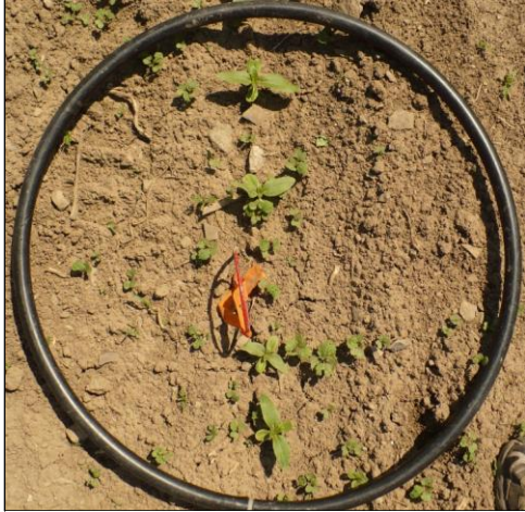
Figure 2. Evaluating crop and weed populations before tinweeding.

Weed and crop populations were measured before and after tinweeding events, which occurred at 16 and 22 DAP (see Figure 2). Weeds were identified and categorized as either annual or perennial broadleaf and grasses.