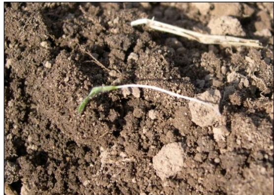
Figure 1. Weed in ideal white thread stage.

This study was conducted in 2011 at Borderview Farm in Alburgh, VT (see Table 1). The soil type at the site was a Benson rocky silt loam. The previous crop was corn. The experimental design was a randomized complete block with three replications. Plots were 10' x 25'. The treatments consisted of one control with no tinweeding, tinweeding at 16 days after planting (DAP), tinweeding at 22 DAP, and tinweeding twice (at both 16 and 22 DAP). The herbicide Treflan (trifluralin) applied preplant on the 24-May at a rate of 2.5 pints per acre. Sunflowers were seeded on May 25 with a John Deere 1750 four-row planter at a rate of 32,000 seeds per acre.