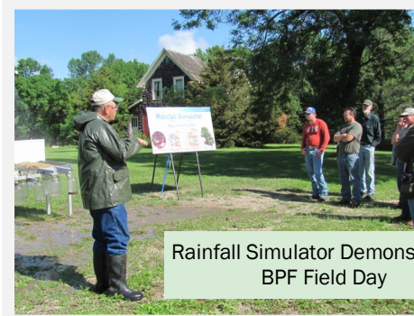
Rainfall Simulator Demonstration BPF Field Day