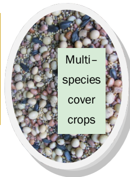
Multi- species cover crops