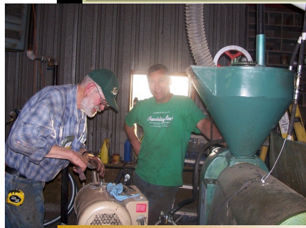
Walder Mfg. Wittenberg, Wisconsin