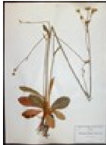
Buddleja Pringlei, Tuscon, 1883 collected by Pringle

Pringle was an avid plant explorer whose botanical field collections remains unsurpassed to this day. For twenty-six years Pringle collected the flora of Mexico for Asa Gray, Gray Herbarium.