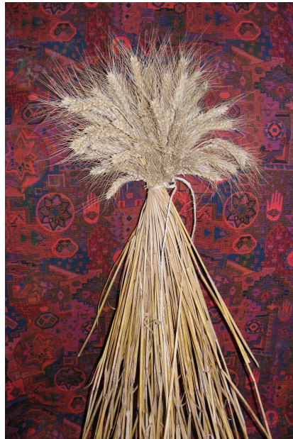
Vermont Winter Soft Wheat - Seed from 1898