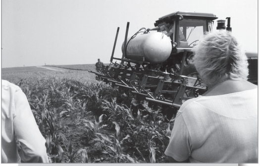
ridges looks like in the spring 2nd Photo Above: A flame weeder in herbicides.