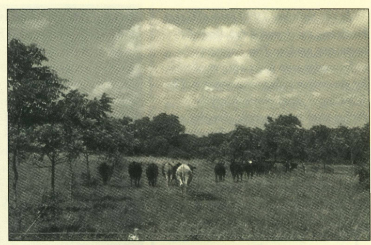
One type of agroforestry at HarperHill is a walnut/forage/cattle silvopastoral practice.

It is noted that the steers established a browse line on the taller trees at about the 6-foot height. Trees shorter than 6 feet were severely damaged