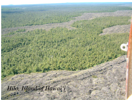
Hilo, Island of Hawai‘i

Legacy Protected: 1,334.98 acres of native forest habitat for Hawaiian song birds (‘apapane, ‘amakihi, i‘iwi) and the native hawk (i‘o)