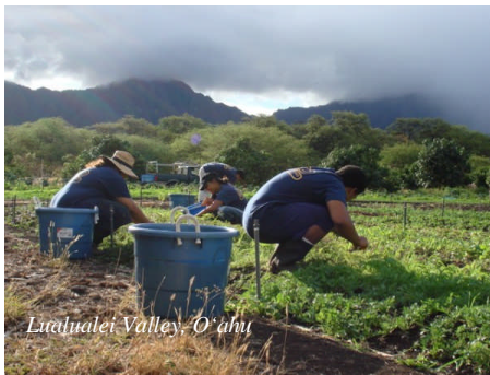
Lualualei Valley, O‘ahu