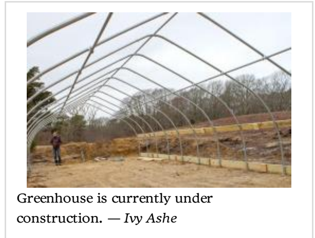
Greenhouse is currently under construction.