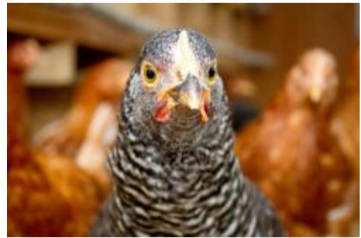
Fifty chickens now call Chappy home.