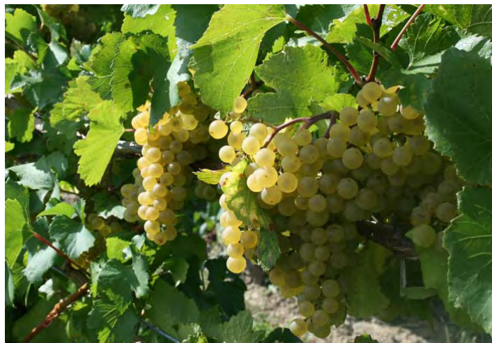
Chardonnay ready for harvest on East Seneca Lake, Thursday, September 22.

Too much of a good thing? It appears that the sunny skies and warm temperatures experienced after bloom in the Lake Erie region resulted in some Concord vineyards having a difficult time making color and developing the flavor profiles this harvest season that the region is known for. National Grape Cooperative has temporarily suspended Concord harvest for their North East, PA processing facility while still maintaining their processing schedule for their facility in Westfield, NY. It appears that when the weather conditions mimic the growing conditions found in Concord vineyards of Washington State so do the color and flavor profiles. It is