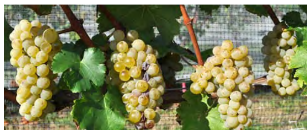
Sauvignon blanc at the LI Hort Res Center, Riverhead.

Here are analytical results of 100-berry samples taken this week at the Long Island Horticultural Research and Extension Center's research vineyard, near Riverhead, NY as part of a long-term variety and clonal evaluation trial, ongoing since the late 1980s.