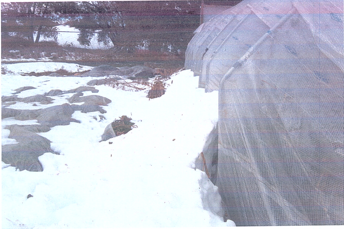
After 3 inches rain , 2 Feet of snow and a lot of wind October 2013