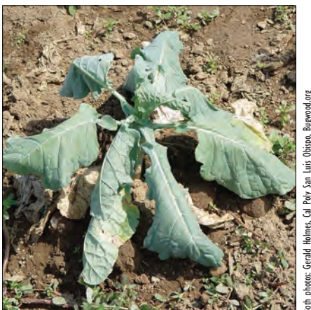
Foliage affected by club root.

Typical symptoms include clublike, deformed roots (see photo) and stunted plants. Low soil pH of less than 6.5 and wet conditions favor this disease. Swimming spores move in water to infect plant roots. Resting spores can survive many years in the soil.