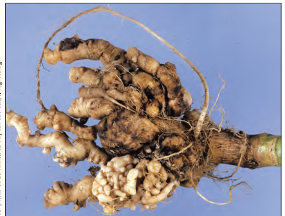
Clubroot in cabbage roots deforms roots.