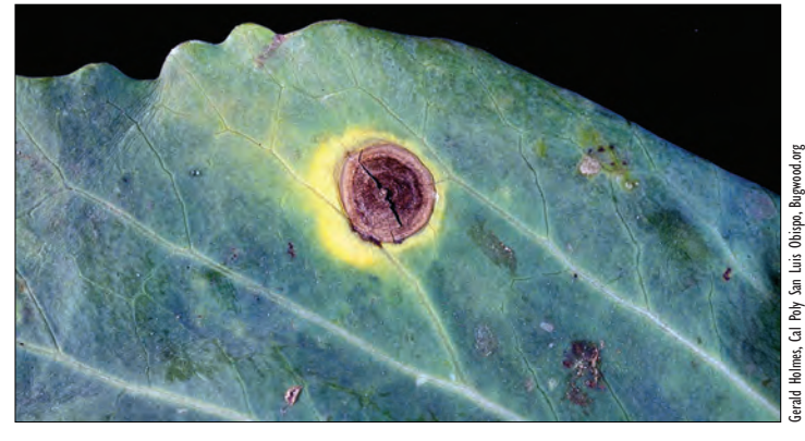
Alternaria leaf spot symptoms.