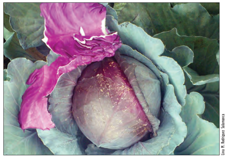
Damage caused by thrips on cabbage head.

Thrips rasp cole crop tissues, which results in scratch-like patterns (see photo) on cabbage and cauliflower. Thrips numbers quickly increase in hot and dry weather. Select varieties that can tolerate thrips and avoid planting cole crops close to alfalfa, clover or small grains, which can be a source of this pest. Insecticide applications are more effective at the beginning of cupping or curd formation.