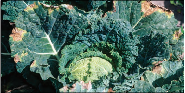
Above, lesions at the leaf margins from black rot. Below, black rot visible in a seedling flat.