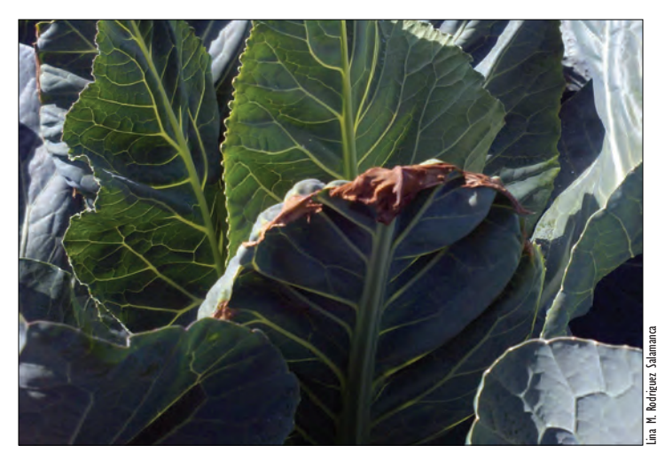
Tip burn in cauliflower leaves, a symptom of calcium deficiency.

Calcium deficiency may occur on acidic soils with intermittent or low moisture and when weather conditions are favorable for rapid crop development. Slow calcium translocation can be driven by high concentrations of other cations (e.g., Na<sup>+</sup>, K<sup>+</sup>, NH4<sup>+</sup>, Mg2<sup>+</sup>), high salinity, low temperatures and high humidity. Symptoms of calcium deficiency include tip burn in cabbage heads, broccoli brown bud and cauliflower curd breakdown and leaf tip burn (see photo).