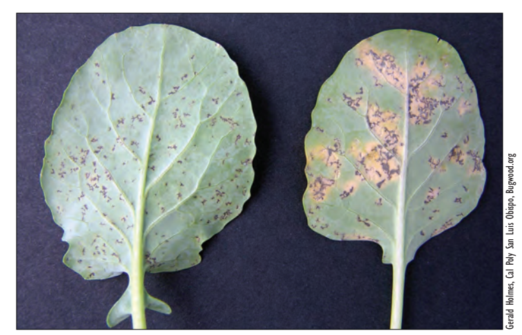
Downy mildew symptoms on cabbage seedling leaves.

Downy mildew occurs under cool (about 59 F) and humid conditions. This pathogen is windborne and can be dispersed short distances by water splashed from irrigation or rainfall. Typical symptoms are discolored, greenishyellow to light-brown lesions with sporulation on the leaf undersides, while gray-to-brown discoloration can occur in curds and heads in the field or postharvest. The pathogen can overwinter in cruciferous weeds or, especially in years following a mild winter, in cole crop volunteers.