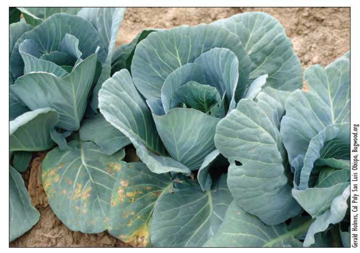
Cabbage plants with downy mildew on the older leaves.

For cabbage variety ratings for disease and insect resistance, consult table 15 of the 2014 Integrated Crop and Pest Management Guidelines for Commercial Vegetable Production (http://veg-guidelines.cce.cornell. edu/15frameset.html).