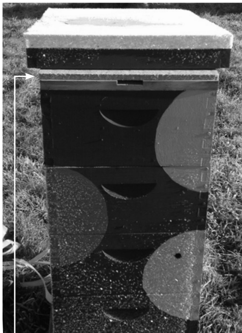
ABOVE: An insulating homasote board (with channel facing down, if present) gets sandwiched between the inner cover and the telescoping cover.

SARE farmer grant applications are due in early December; application information, project guidelines and expectations, as well as reports from projects presently funded are available on the Northeast SARE website, nesare.org. It is not too early to be thinking about a 2014 application. 🍄