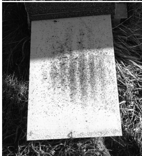
AT RIGHT: Note how a screened bottom board (SBB) insert can be a valuable evaluation tool in the cold months, as debris from the colony can indicate the location of the cluster, honey consumption (pale cappings), baby bee emergings (darker cappings), and obvious presence of varroa mites.