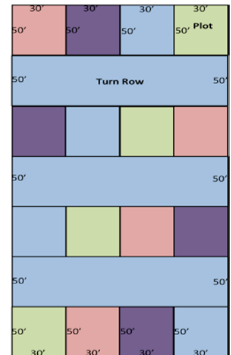
Figure 2. Plot Map. Blue is untreated seed, green is fungicide treated seed, red is Gaucho + fungicide treated seed, and purple is Cruiser + fungicide seed.

The study is being conducted at the Central Maryland Research and Education Center in Beltsville, MD, and at the Wye Research and Education Center in Queenstown, MD. At each site, we are planting four replicate plots of each treatment using no-tillage practices. Treatments include: Cruiser and fungicide treated seed, Gaucho and fungicide treated seed, fungicide treated seed, and untreated seed (Figure 2). The same active ingredients will be planted into the same physical location for each grain in the rotation in each plot every year. Standard mid-Atlantic seeding rates, varieties, irrigation, and fertilizer programs are used to achieve plots that best