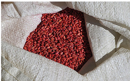
Figure 1. Wheat seeds that have been treated with Cruiser and fungicide.

Neonicotinoids are a class of systemic, broad-spectrum insecticides that are applied as foliar sprays as well as soil or seed treatments. The latter treatments are one of the most convenient and economical ways to protect a variety of crops from insect damage. Compared to older classes of insecticides, neonicotinoids have low toxicity to fish and mammals, and have become the most widely used classes of pesticides in the US, since their introduction in the 90s. Seed treatments are a safer and less invasive way to apply pesticides, minimizing off-site drift of the active ingredient. They play an important role in grain crops, as they are used to control soil and seedling pests on the majority of corn and about half the soybean grown in the country. They can also be used on wheat (Figure 1). This is not as common, but usage is growing. In the mid-Atlantic regions, these grain crops are typically grown in a crop rotation.