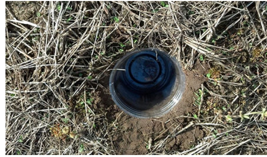
Figure 4. Pitfall trap set up in soybean field to capture ground-dwelling arthropods such as beetles.

At each site, the abundance and diversity of invertebrate communities on plants and in the soil are determined throughout the season using various sampling methods, such as sweep-net samples, sticky cards (Figure 3), pitfall traps (Figure 3, 4), litter samples, and visual counts (Figure 5). This allows us to measure both pest and beneficial communities present in the field. We are also sampling the soil for earthworms and measuring soil microbial activity to determine whether neonicotinoid residues in the soil impacts soil fauna. To see if seed treatments increase yield by reducing pest damage or increasing plant growth and establishment, we will measure grain yield and stand density. The neonicotinoid residue from the soil may also be taken up by weedy plants, and be present in pollen and nectar, representing a potential route of neonicotinoid exposure to pollinators. In winter wheat, we will analyse for the presence of neonicotinoids in winter annual flowers, such as chickweed, which serves as an early spring source of pollen and nectar for beneficial pollinators. Physical properties of the soil like carbon, available nitrogen, mineralized nitrogen, and pH were measured at the beginning of the study and will be measured again at the end.