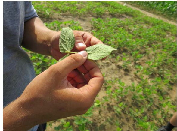
Figure 5. Visual inspection of soybean trifoliolate leaf for insect pests such as thrips and beneficial insects such as minute pirate bugs.