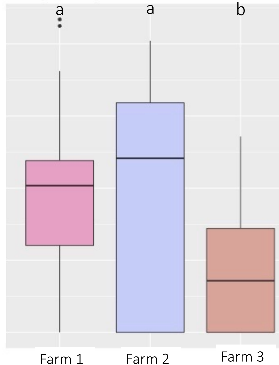
Plant alpha diversity of all sites in 2021