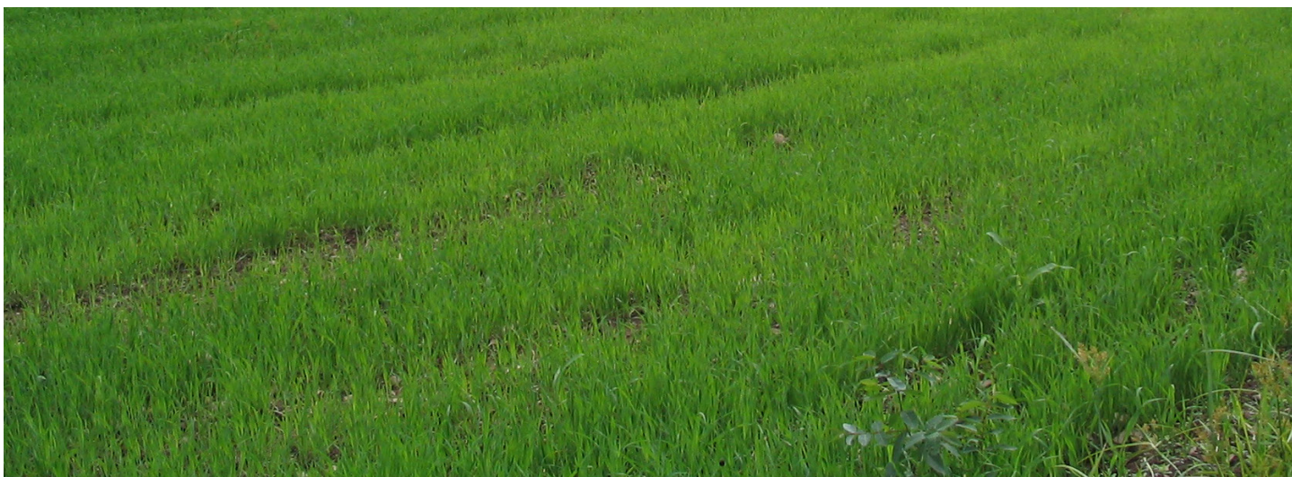
Oats planted in August after the corn was destroyed by a flood, shown in late September prior to harvest as forage.

vides high sugar levels, helping ensure good fermentation and high energy.