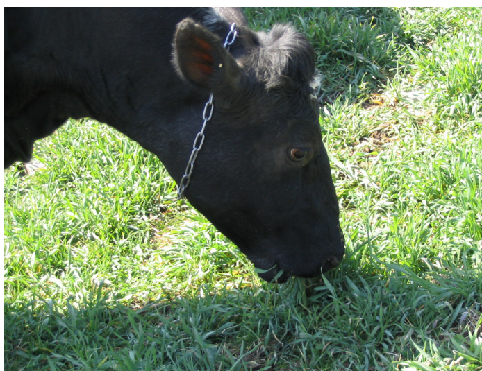
Dairy cow finishing the first of three grazings of winter rye on April 11.

They plowed a native bluegrass pasture and planted it with BMR SS, followed by an August planting of winter rye. The BMR SS provided more than three weeks of grazing during a