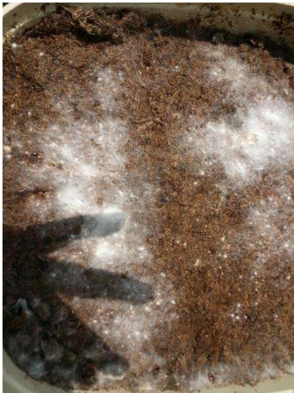
Methane Digester Bochasi