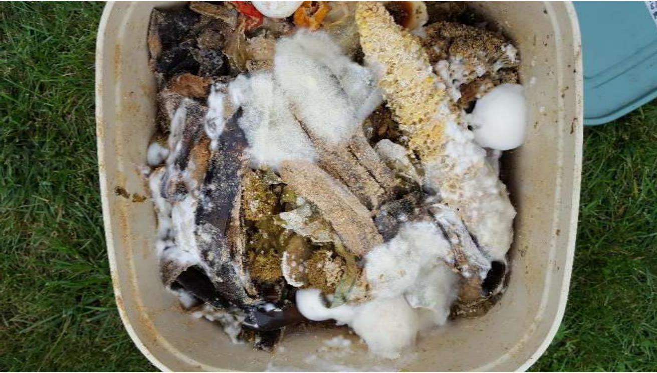
Kitchen Bochasi going into the ground after inoculation. . .