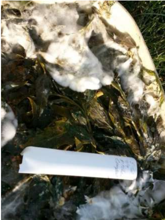
Kitchen Scrap Bochasi