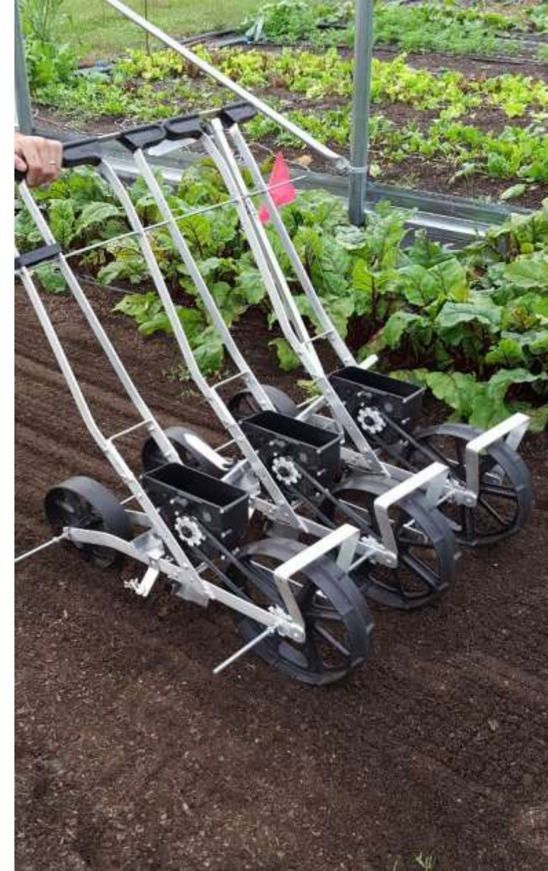
September 2016 Laying out two block designs and planting radish.