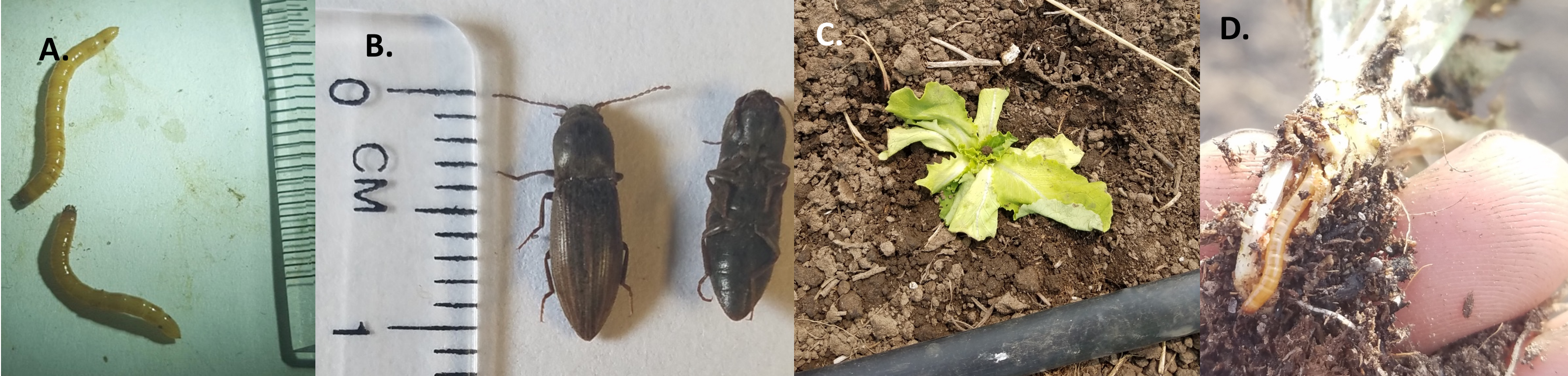
Figure 1. A. Wireworm ( Agriotes spp.) larval stage; B. Click beetles, the adult stage of wireworms; C. Lettuce wilting from wireworm damage; D. Wireworm feeding on lettuce.