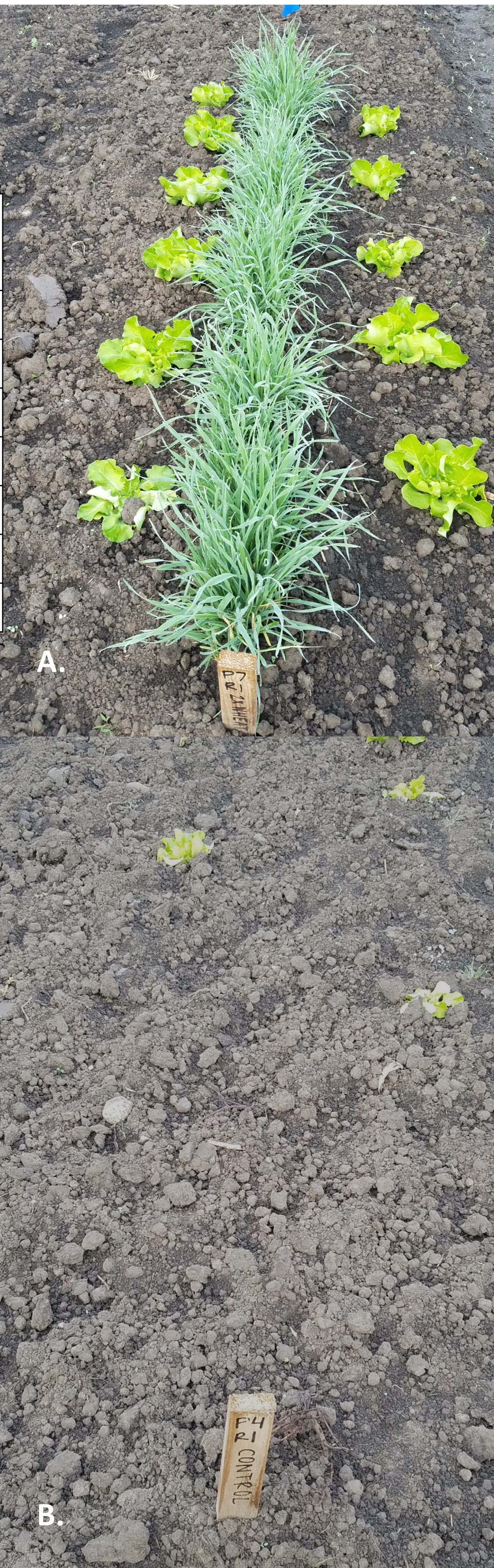
Figure 4. A. Wheat treatment; B. Control treatment.

This project was funded by Western SARE grant #OW18-018. Spinosad bait was donated by Certis. On farm trials were hosted by Mama Bird Farm, Lopez Harvest, Maple Rock, Calliope Farm, Skagit Flats Farm and Viva Farms.