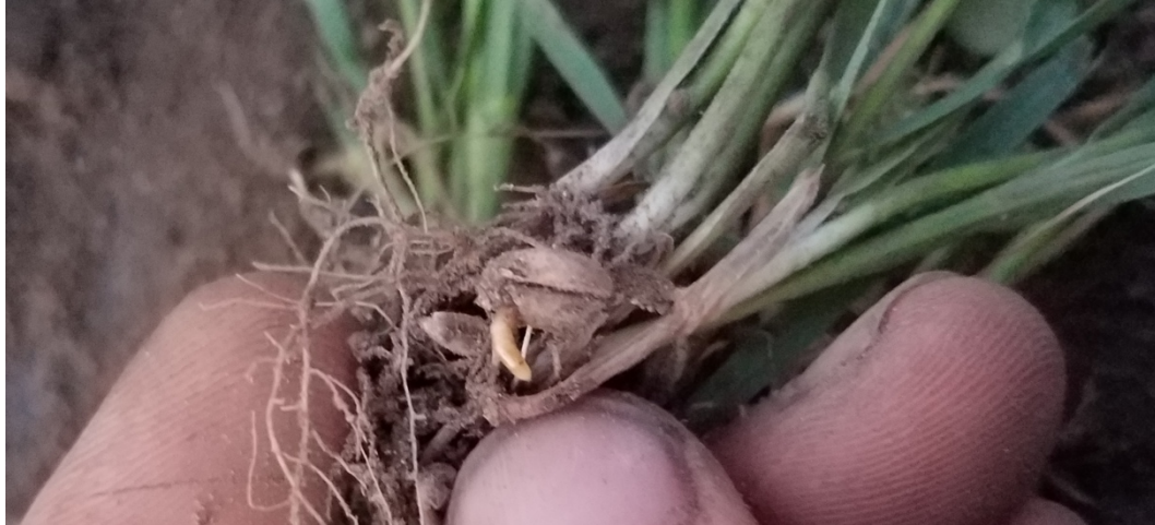
Figure 5. Wireworm feeding on wheat trap crop.