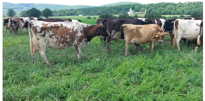
Swallowdale Farm's grass-fed cows grazing millet.

Swallowdale Farm is a certified organic grass-fed dairy farm located in Orwell, VT. This dairy farm has been certified grass-fed for approximately 3 years. The herd is composed of approximately 80 crossbred dairy cattle that calve year-round. The average daily milk production for the herd with TAD milking was 37.9 lbs/cow. During that time the herd was certified organic and thus still feeding grain daily.