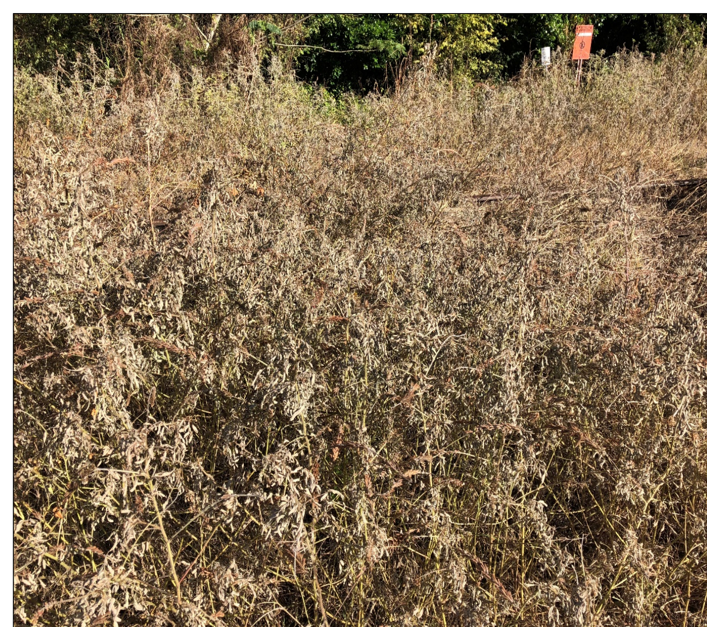
Figure 1. Hairy indigo naturalized in Florida. A wild population in Alachua county flowers in September (A) and seed matures in October (B).