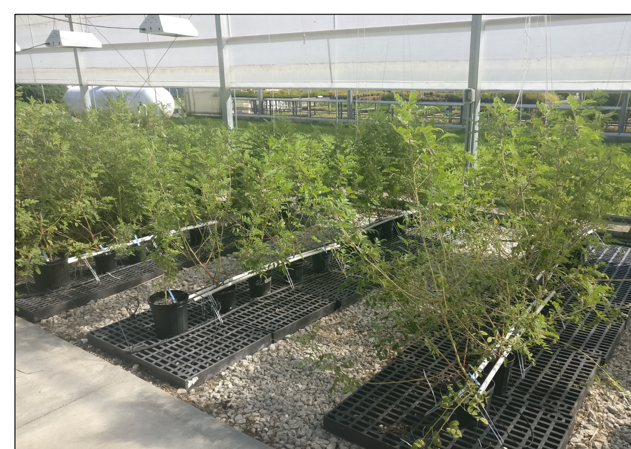
Figure 2. Hairy indigo seed increases at the UF/IFAS Forage Breeding and Genetics greenhouse.

This study was conducted to determine hard-seededness in hairy indigo, and identify plants exhibiting soft-seededness to use them in breeding.