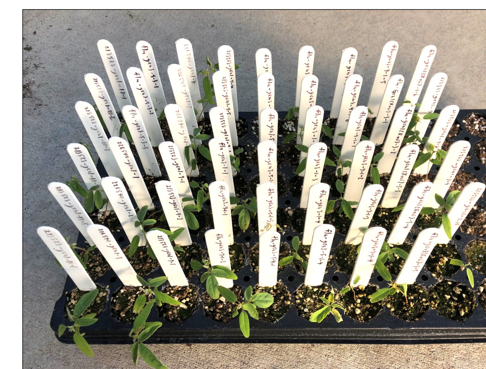
Figure 5. Hairy indigo seedlings selected from soft-seeded genotypes.

Seedlings that germinated 3 days after planting from genotypes with significantly lower hard-seededness were selected for generation advance. These plants are grown under greenhouse conditions to allow seed production and future germination tests (Figure 5).