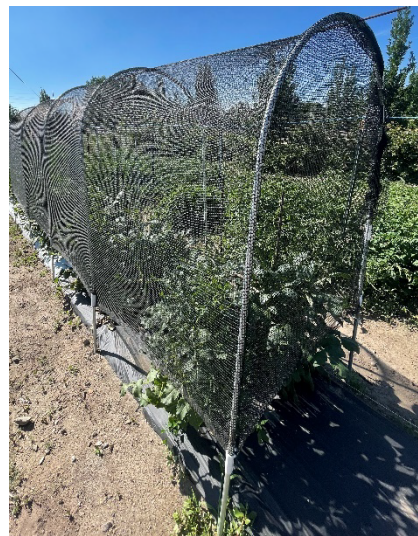
Figure 5. Dahlias oriented east-west at Wheeler Historic Farm in Murray, Utah. This allows for shade to be attached to only the south side and top of the low tunnel for more wind flow and efficient harvests.

flowering. Florist-grade stem lengths vary by market and use. Some dinnerplates were marketable with stem lengths as short as 6 to 12 inches and used in specialty arrangements, such as arches. However, minimum stem lengths of 12 to 16 inches were more common. Place the cut stems directly into water while harvesting to avoid wilting. Use of chicken wire across the openings of buckets helped place stems in water without blooms falling in and becoming wet. After harvest, strip leaves, trim the ends, and place in warm water with floral preservative. For most dahlias, a vase life of 3 to 7 days is expected if proper harvest and storage procedures are followed. Dipping stems in boiling water may help rejuvenate wilted blooms to modestly extend vase life. Larger bloom types tend to have shorter vase lives than smaller bloom types and can be more easily damaged.