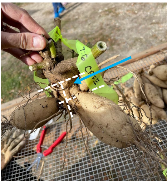
Figure 2. Dahlia tubers that can be divided (white dashed line), such that each tuber has one eye (teal arrow).

Tubers often come in clumps that can be divided. When separating tubers, ensure each tuber has at least one