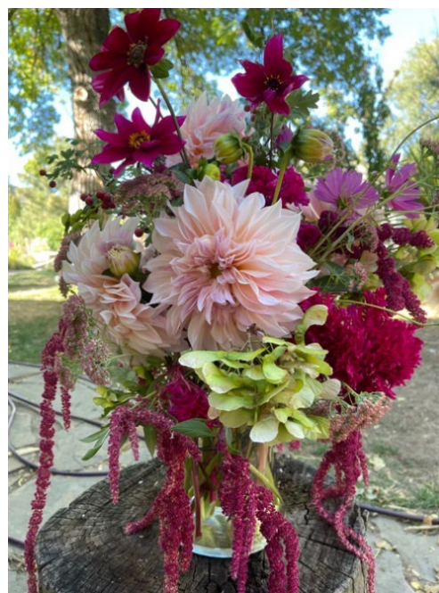
Figure 8. Dahlias as a showstopper in arrangements. ‘Café au Lait’ dinnerplate is featured here.

Viral diseases are very common, often introduced by infected plant stock. Finding certified virus-free stock is highly recommended, as infected plants cannot be cured and should be isolated or removed to prevent disease spread. Scout plants for virus symptoms (Table 1 and Figure 9) and pests (Table 2), and follow best management practices, such as sanitization of harvest equipment. The USU Plant Pest Diagnostic Lab offers comprehensive testing for in-state growers. Email Dr. Nischwitz ( claudia.nischwitz@usu.edu ) for more information. Including a picture of the suspected diseased plant, the name of the crop, and your location is recommended.