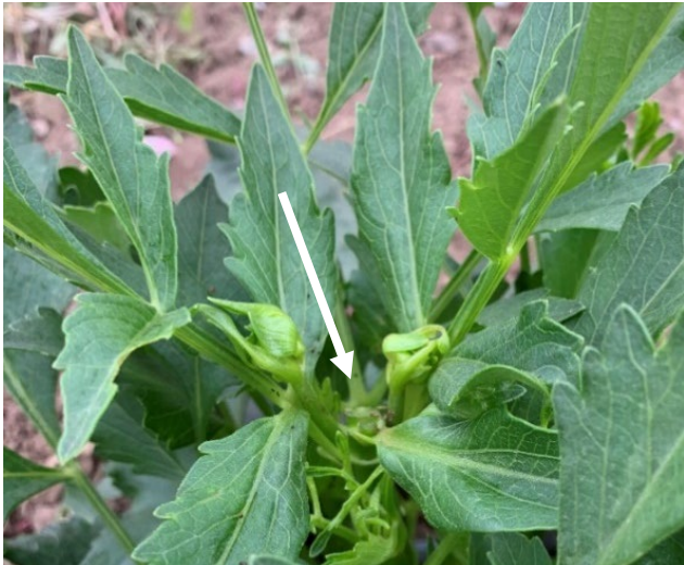
Figure 3. The terminal bud was pinched (yellow arrow) when this plant was 12-inches tall.

Pinch plants when they are 12-inches tall to promote branching. To pinch, remove the terminal bud by cutting the stem at the next node (Figure 3). Pinching can slightly delay initial bloom but increases the total yield of marketable stems and avoids unmanageable initial stems with unusably large stalks.