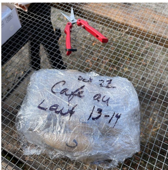
Figure 7. Tubers of two divided plants are individually wrapped with plastic, then packed together and labelled for storage in a root cellar.