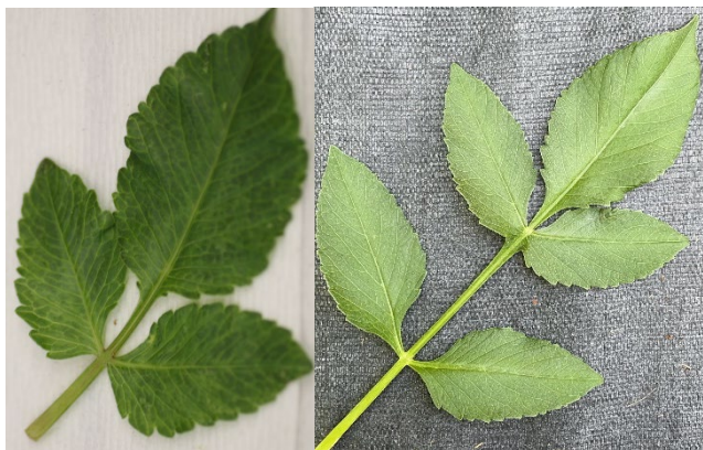
Figure 9. Left) A dahlia leaf with faint mosaic patterns from Dahlia Mosaic Virus (DMV) . Right) An uninfected, healthy leaf.