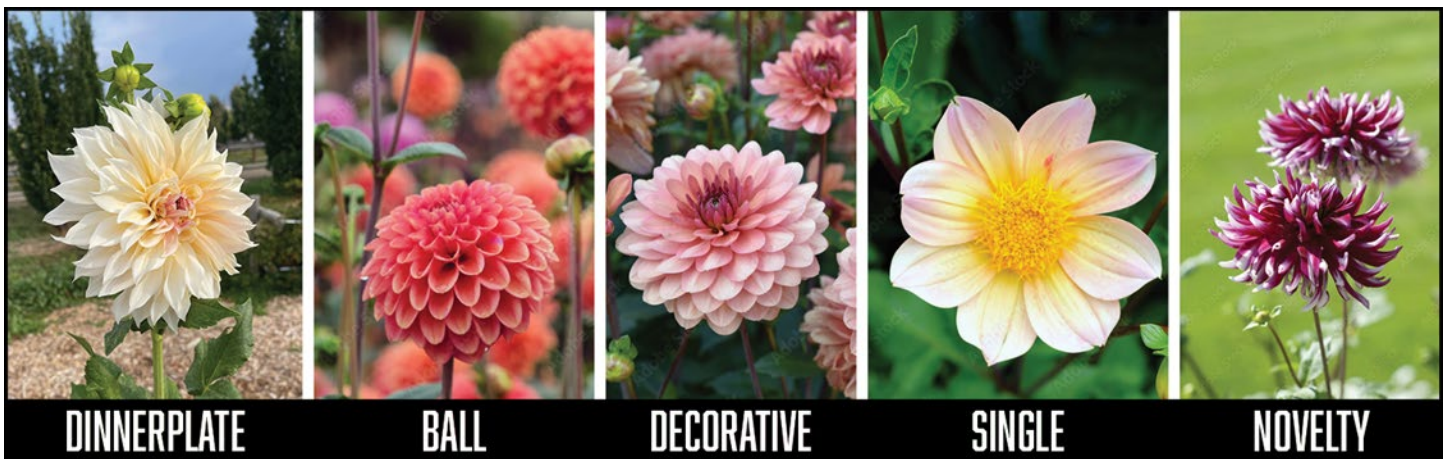
Figure 1. Example dahlia bloom types for cut flowers.