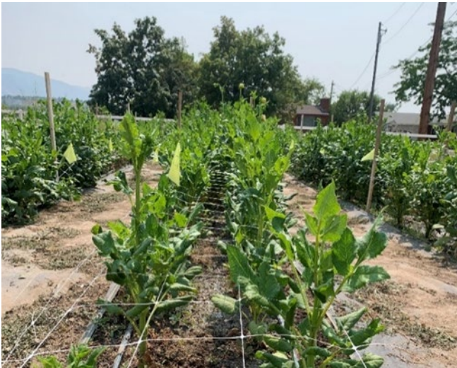
Figure 4. Dahlias with the first layer of horizontal trellis at a 12" height. As plants grow, a second layer at 24-30" will be added to prevent toppling and encourage straight stems.