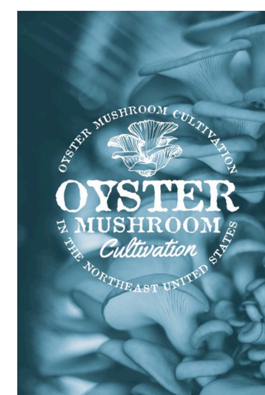
The cover of a 32 page booklet created for outreach.