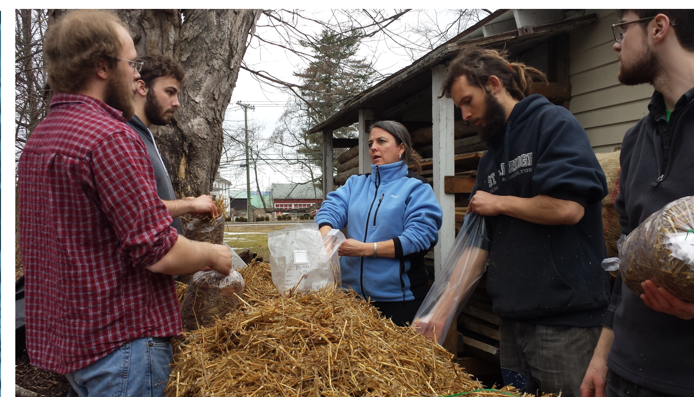
A workshop held to discuss the results of the study and practice inoculating straw

After concluding the research phase of this project Willie presented at several conferences, published a guidebook and hosted a workshop. The booklet is a 32 page report on the findings of the study as well as a review of the process of oyster mushroom cultivation. The booklet is available on the fungially website and was shared through several email lists.