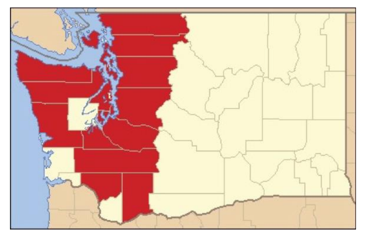
Figure 1. Documented distribution of Agriotes lineatus and A. obscurus in Washington State based on adult pheromone trapping and larva identification (adapted from LaGasa et al. [2006] and Brouwer et al. [2020]).

Wireworms are generally long and slender with a shiny and hardened exoskeleton (Figure 2, top photo). Their bodies are most often a toasted caramel color with a darker reddish-brown head. Agriotes larvae have two "eye spots" on the top of the ninth abdominal segment, and the tip of this segment is bluntly pointed (Figure 3, top photo). In Limonius , there are no "eye spots" and the tip of the ninth abdominal segment has a small "key-hole" opening (Figure 3, bottom photo). As with adult click beetles, wireworms have three pairs of legs located on several segments behind the head and possess chewing mouthparts.