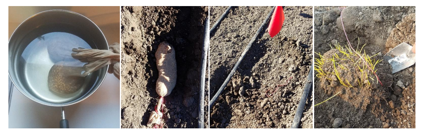
Figure 14. Setting a bait trap: soak grain seed for 12 to 24 hr (left photo); bury mesh bag 6 to 12 inches (second from left photo); flag location of trap (second from right photo); dig up trap after one week (right photo). Photos: B. Brouwer.

Figure 13. Soil sampling for wireworms using a shovel: sample six to ten inches deep (left photo); round soil off shovel to approximately a six-inch diameter (second from left photo); count wireworms in sample (second from right photo); plastic tray can help catch wireworms as you sift through sample (right photo). Photos: B. Brouwer.