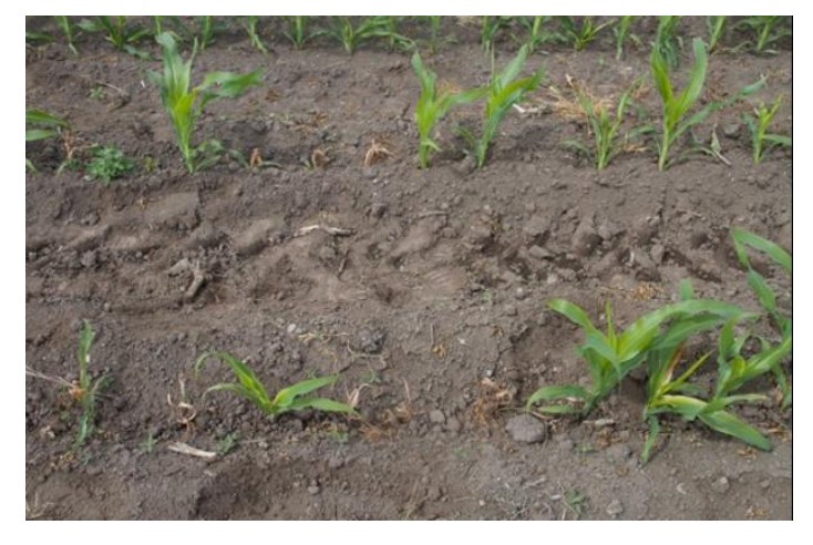
Figure 11. Corn (Zea mas) stand thinned by wireworm.