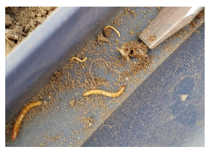
Figure 7. Multiple generations and sizes of larvae present in a field.

Figure 6. Neonate larva.