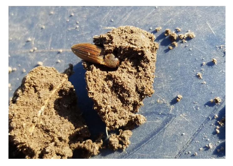
Figure 4. Adult preparing to overwinter in soil at approximately six inches in depth.