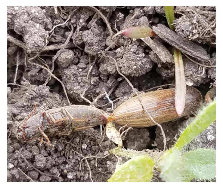
Figure 5. Mating behavior in spring. Photo: B. Brouwer.

Figure 4. Adult preparing to overwinter in soil at approximately six inches in depth. Photo: B. Brouwer.