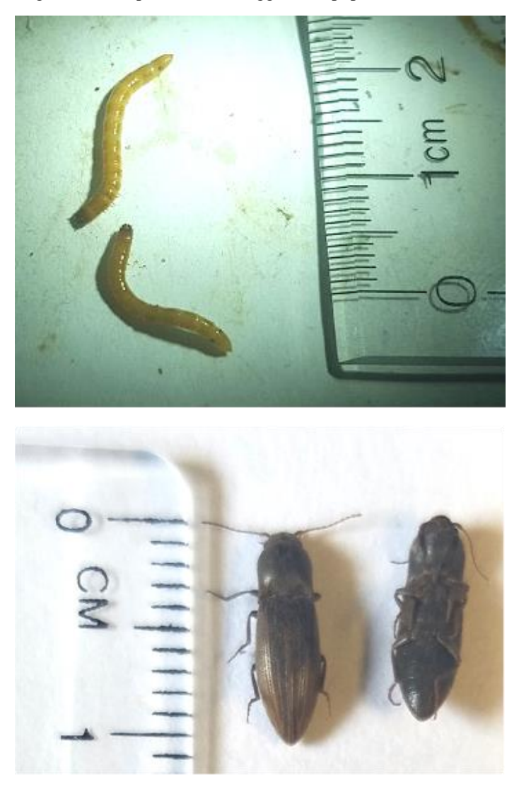
Figure 2. Agriotes sp. larvae (top photo) and Agriotes lineatus click beetles (bottom photo).

Depending on the species, wireworm larvae grow to as long as approximately 1.6 in. and are often longer than adults when mature. Fully grown Agriotes larvae are more typically between 0.6 to 0.9 in. long. These insects undergo complete metamorphosis, meaning the immature (larval) and adult (flying beetle) growth stages exhibit distinctively different forms. The stages of development include egg, larva, pupa, and adult.