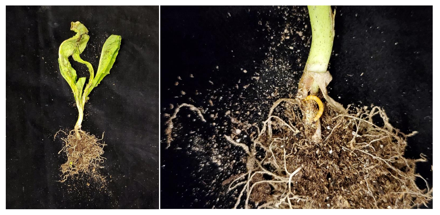
Figure 10. Young lettuce (Lactuca sativa) seedling damaged by wireworm (left photo). Close-up of wireworm on lettuce seedling roots (right photo).

(Figure 11). In a heavy infestation, bare spots may appear in the field and replanting is necessary. Damage to seedlings often occurs in the crown portion where larvae bore distinct holes and are themselves sometimes found in the damaged portion. Feeding on roots, tubers, and bulbs is unlikely to kill the plant; however, even cosmetic damage is likely to reduce marketable yield (Figure 12). Wireworms are most active in spring and late summer when soil temperatures are between 50°F and 77°F, though damage has been observed throughout the summer in western Washington.