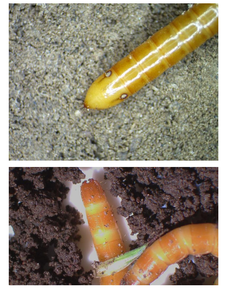
Figure 3. The tail of Agriotes spp. are bluntly pointed (top photo), while the tail of the Pacific coast wireworm ( Limonius spp.) is key-hole shaped (bottom photo).

The duration of the larval stage depends on the species, soil temperature, and food availability, and can extend up to five years for complete development. Wireworm larvae pass through approximately seven to nine instars (phase between molting) prior to pupating, depending on the species and environmental conditions (Traugott et al. 2015). After hatching, larvae disperse in the soil profile, where individual larva have been found to burrow to a depth of at least five feet, and range laterally approximately three to five feet (Traugott et al. 2015). They migrate to the soil surface in the spring as soil temperatures increase. This vertical movement typically coincides with spring planting. In western Washington, pupation typically occurs in August and September. The adults remain in the soil to hibernate during the winter and emerge the following spring. Figures 4–9 and Figure 16 show the stages of the wireworm life cycle.