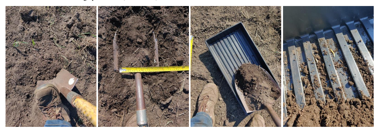
Figure 13. Soil sampling for wireworms using a shovel: sample six to ten inches deep (left photo); round soil off shovel to approximately a six-inch diameter (second from left photo); count wireworms in sample (second from right photo); plastic tray can help catch wireworms as you sift through sample (right photo).

The second method for monitoring wireworms is bait trapping (Figure 14). Bait traps are more effective at detecting low levels of wireworms than random soil samples. To deploy bait traps, bury a mesh bag of flour or germinating seed (e.g., wheat or corn) in the soil, which releases carbon dioxide and attracts wireworms. Dig up the bag after seven days and inspect the surface and contents for wireworms. The effectiveness of baiting can be reduced if a poor bait is chosen, too few samples are taken, sampling is done during inclement weather, a field was recently tilled, or bait is left in the soil too long. For large-scale production, a minimum of one bait trap per acre is recommended, while for smaller scales (less than one acre up to approximately five acres), five to ten traps per field are recommended. There may be variation in wireworm species preference for different bait types, but this is not well documented. See Wireworm Scouting: The Shovel Method and the Modified Wireworm Solar Bait Trap (Esser 2006) and Wireworms: A Pest of Monumental Proportions (Rondon et al. 2017) for more details on soil sampling and bait traps.