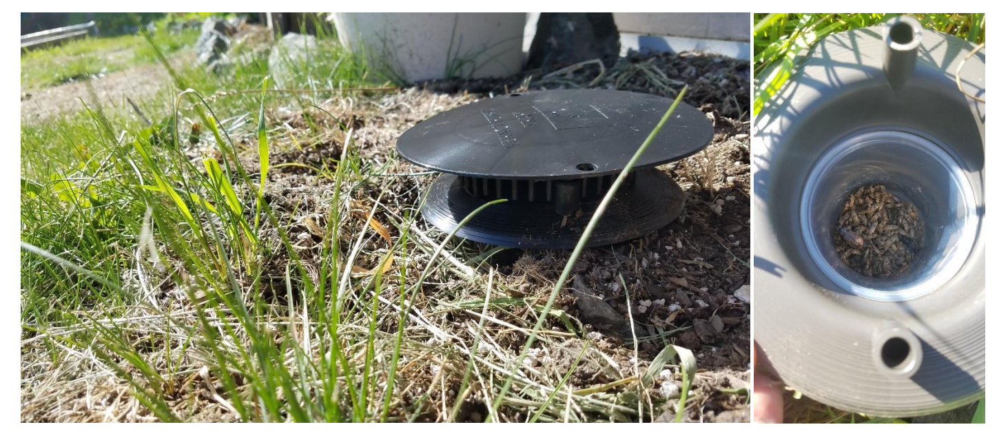
Figure 15. Monitoring for click beetles using a species-specific pheromone lure and a Vernon Pitfall Trap. Trap is located at edge of grassy field (left photo). Contents of trap after one week using Agriotes lineatus lure (right photo).

Selecting fields that have been managed for low weed populations is also important. Patchy weeds and grassy areas provide good conditions in which females will deposit eggs, as they specifically lay eggs in these patches to decrease the chances that the eggs will dry out (Benefer et al. 2012). In contrast to the stable environment provided by long-term perennial grass cover, tillage disrupts wireworm larval populations, causing desiccation and predation, eventually reducing wireworm food availability (Vernon and van Herk 2013).