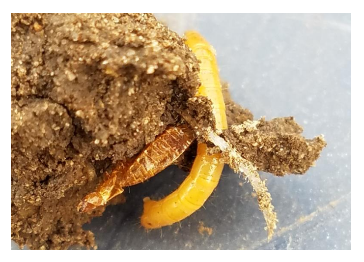
Figure 8. Wireworm molting.