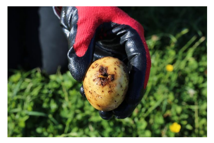
Figure 12. Wireworm emerging from a potato ( Solanum tuberosum ).