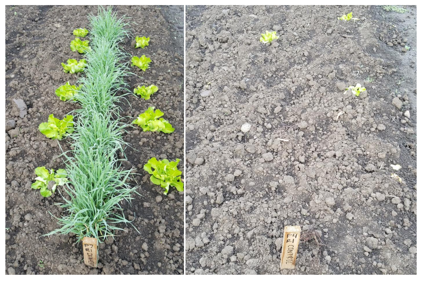
Figure 17. Trap cropping with wheat planted between rows of lettuce transplants (left photo), and a plot in same field without trap crop (right photo).

Currently available options for organic-approved insecticides have not been found to be effective or evaluation has been limited. Specifically, laboratory studies and field trials have found that Spinosad-based products applied as a seed treatment (van Herk et al. 2015) or as a soil-applied bait are not effective for wireworm control (Brouwer et al. 2019). Spinosad has, however, been found to have a synergistic effect with entomopathogenic fungi ( Metarhizium anisopliae ), resulting in higher rates of wireworm mortality when used in combination (Ericsson et al. 2007). See the <u>Hosts and Pests of Vegetable</u> <u>Crops</u> (Green et al. 2021) section of PNW Insect Management Handbook for additional crop-specific pesticide recommendations.