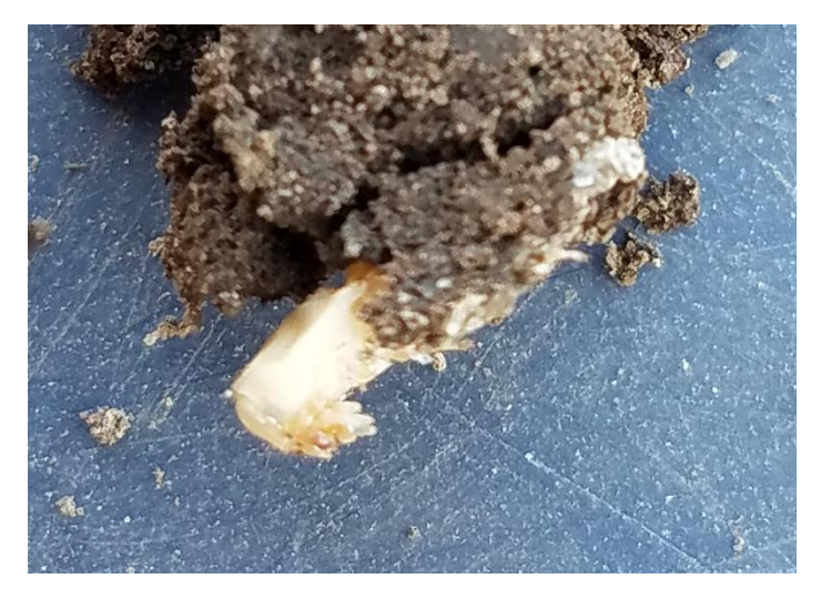
Figure 9. Pupae found in soil in early fall.