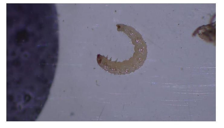
Figure 6. Neonate larva.