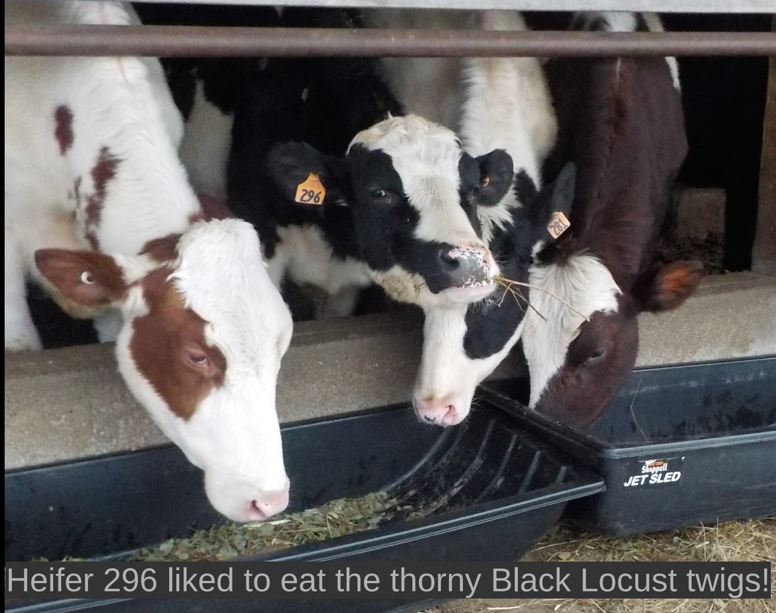
Heifer 296 liked to eat the thorny Black Locust twigs!

(That was the coldest week in January; very sorry that my camera fogged up.)